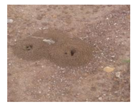
Figure 1. Type I Anthill Situated in Front of Owolabi Hall at Afe Babalola University, Ado-Ekiti, Nigeria