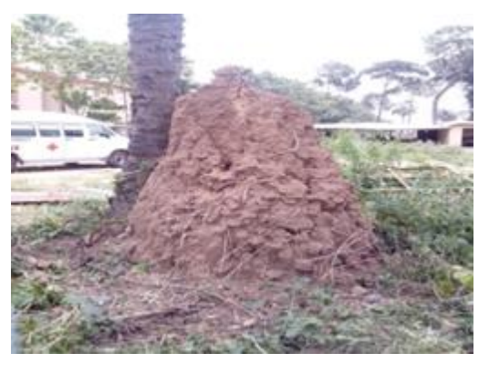
Figure 2. Type II Anthill Located at Afe Babalola University, Ado Ekiti, Nigeria on an Elevation of 1165 ft. above sea level, having latitude (N7°36. 409) and longitude (E005°18.627)