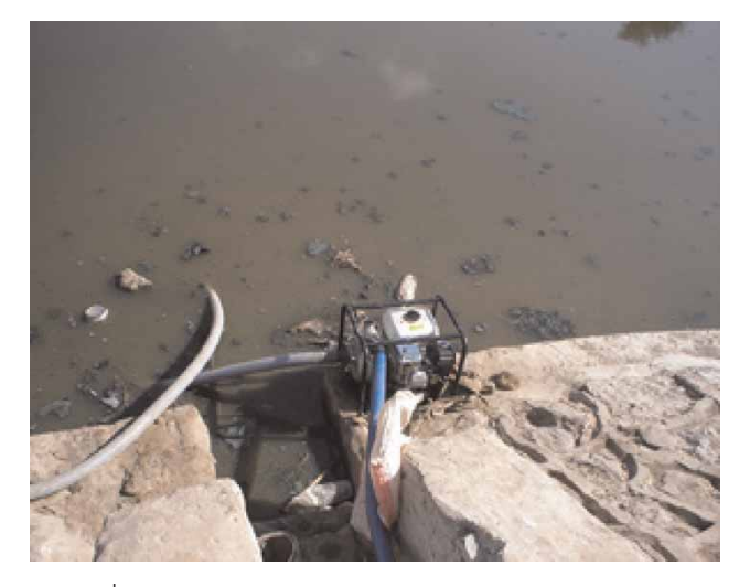
Figure 4 | Yemeni farmers are pumping sewage directly from stabilization pond to irrigate agricultural crops (IRIN 2009).

On the other hand, STPs are responsible for spreading antibiotic-resistant bacteria into the natural environment (Laroche et al. 2009; Servais & Passerat 2009; Garcia-Armisen et al. 2011). This is due to the random use of antibiotics among the population that leads to increased concentrations of antibiotics in sewage and increased antimicrobial resistance among the bacterial population in the sewage. On average, 51% of the drugs used in Yemen are antibiotics (Al-Shami et al. 2011). A study conducted by Akhali et al. (2013) revealed that most of the antibiotics are used without medical prescription. In addition, most doctors prescribe antibiotics without culture and sensitivity testing. These practices lead to an increase in the distribution of antimicrobial resistance among pathogenic bacteria in sewage.