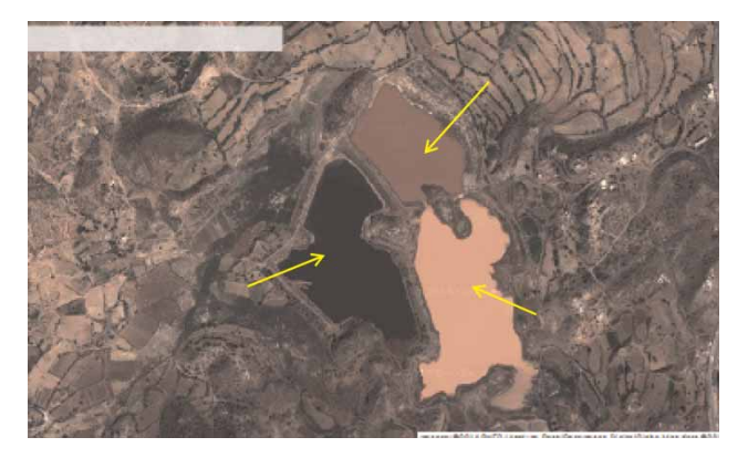
Figure 3 | Google map of stabilization pond, Al-Burihi, Taiz, Yemen (see the agricultural area around the stabilization ponds).

practicing reuse of non-treated or partially treated sewage effluents. They are pumping sewage directly from stabilization ponds to irrigate agricultural crops (Figure 4) (Boydell et al. 2003; UN 2003).