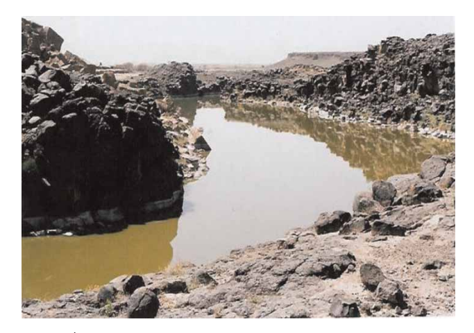
Figure 2 | Dam contaminated with sewage (Al-Mosireqa-Al-Rawda, Sana'a, Yemen) (Parliament's Water and Environment Committee Report 2004).

Yemen is the least advanced country among Middle Eastern countries in sewage reuse and safety control. It has a predominantly rural setting, limited sewer connection, deteriorated STPs, which do not meet the national quality requirement, and reuse patterns, which are completely uncontrolled (ACWUA 2010). Regardless of the quality of sewage effluent, farmers living near the disposal sites of sewage, especially in some of the large cities such as Sana'a (Figure 2), Taiz (Figure 3), Aden, and Ibb, are already