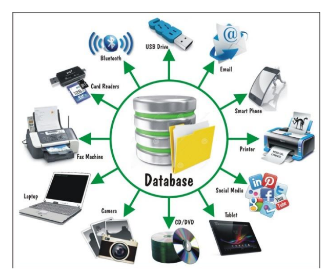
Figure 3. Some common data leaking channels

Some of them will require a great number of techniques and monitoring to adequately secure them.