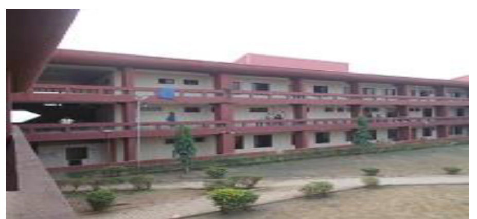
Figure 1: Maternity wards (UITH, Ilorin)

Furthermore, the interview data found that signage was used as the main landmark at decision points in hospital wayfinding. This result corroborates the findings of other researches that textual signage, directional signs, and bold graphics used as landmarks at decision points have been shown to positively improve wayfinding performance (Tzeng & Huang, 2009; Brunye et al., 2018). This infers that textual and graphic signage should be with pictographs to improve wayfinding performance in the hospitals (See Figure 2). As such, signs should be consistently clear in terms of meaning and understanding to all users, and be translated into main local languages of the community or region.