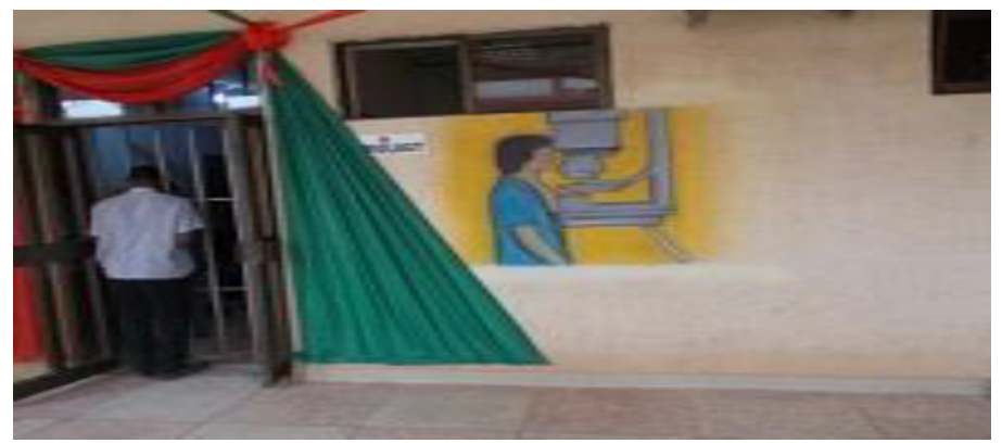
Figure 2: Radiology at UITH