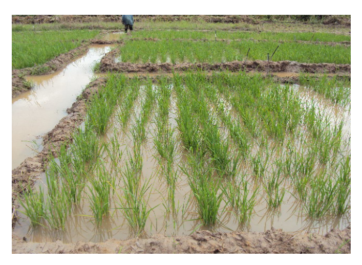
Figure 2. Continuous flood of rice fields to control weeds

The flooding of rice field is the most effective cultural practice for weed control in lowland rice ecology and constant water height of 8-15 cm prevents the germination of most weed seeds and kills the majority of emerged weed seedlings (Thomas et al., 1983). In order to achieve effective water management, the field must be bonded as shown in Figure 2.