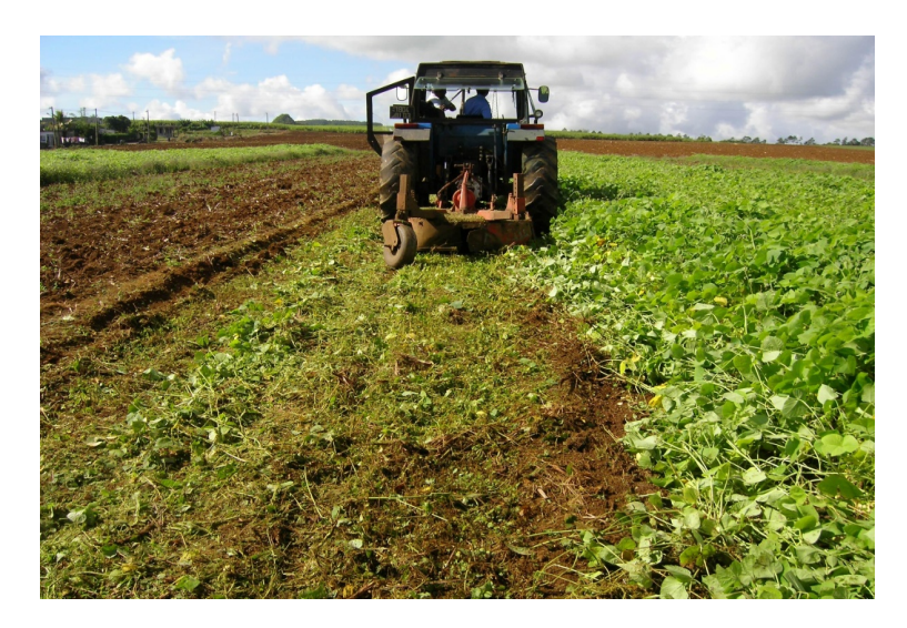
Figure 3. Incorporation of lablab used as legume break to control weeds

Generally, vigorous cover crops like Mucuna spp, Vigna unguiculata and Lablab purpureus are effective in smothering the growth of weeds (Teasdale et al., 2007). The lowland rice farmers should keep their field busy with legumes like lablab during the off-season to be incorporated into the soil in order to reduce weed infestation and also to improve soil fertility in the subsequent season (Figure 3). The limitation to the adoption of this method is that money and labour are required to maintain the legume and the farmers perceive no immediate benefits and are thus reluctant to adopt.