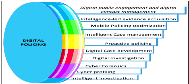
Fig. 1. The wheel of digital policing

Applying digital technologies across policing services can enable police forces to use their resources more intelligently, proactive in identifying and addressing