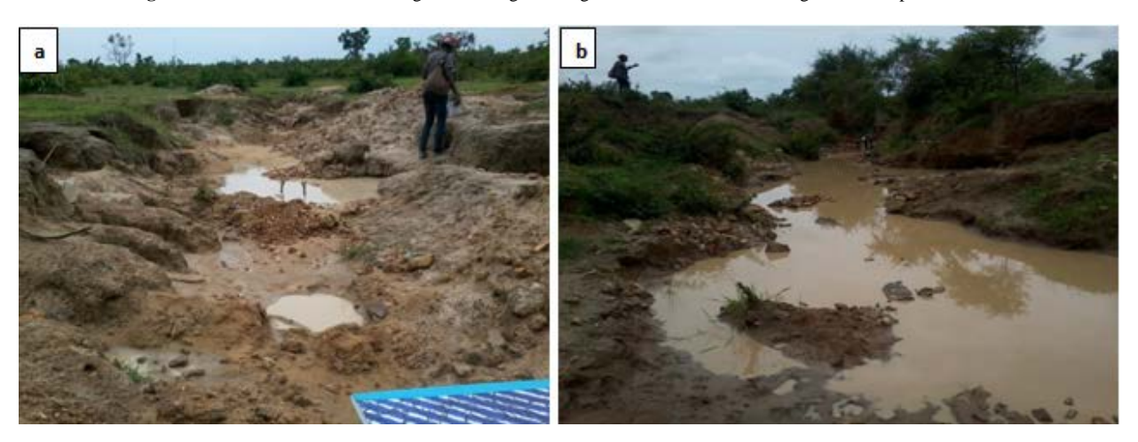
Figure 4. Collapse of river bank due to sand and gravel mining in Luku