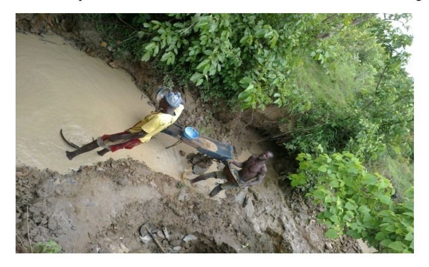
Figure 6. Polluted river water due to sand, gravel and gold mining in Luku Village

materials. In-stream mining of sand, gravel and gold in the area has led to the re-suspension of sediments in the water causing the brownish colouration of the water and this water is been consumed by the miners in the area due to lack of alternative source for drinking water (Figure 6).