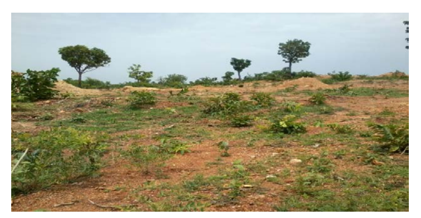
Figure 5. Destruction of vegetation due to sand and gravel mining leading to lost of natural habitats of some animals and some plants species

Mining of sand and gravel in the study area resulted in destruction of vegetation thereby destroying the natural habitats of some animals (Figure 5). Some very important plant species are also destroyed and the soil is exposed to erosion.