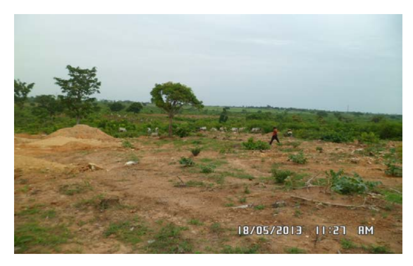
Figure 2. Loss of Vegetation due to sand and gravel mining. This leads to reduction in farming and grazing grounds in the study area