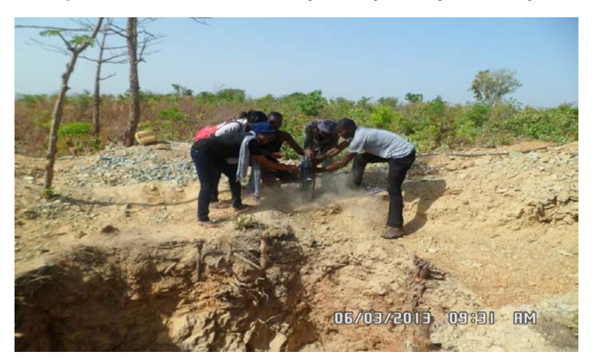
Figure 7. Dust generation due to drilling activity resulting in air pollution in Luku