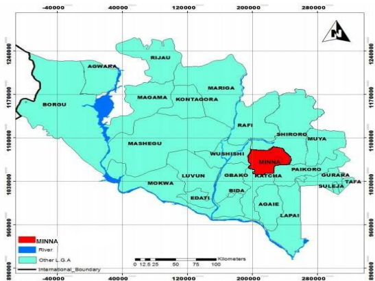
Figure 1 Map of Niger State showing Minna City

Minna, is a rapidly growing urban centre in North-Central Nigeria which is located between Latitudes 9°62' N and between Longitude 6°55' N. It lies wholly with the physical and cultural zone of transition described as the “middle belt of Nigeria”. Kaduna and Federal Capital Territory border the State to both North-East and South-East respectively. Minna has a total land area of 74,344 km 2 wide and it is approximately 8% of the land area of the country. Minna is a town comprising majorly Gbagi, Nupe and Yoruba and Hausa speaking people. The population of Minna has grown 176,756 (NPC 2016) at 3.2% growth rate. There are twenty-four neighbourhoods in Minna. The main modes of transportation in the City include Cars/taxis, Mini-buses and motorcycle popularly known as ‘okada’ and tricycles known as ‘keke napep’.