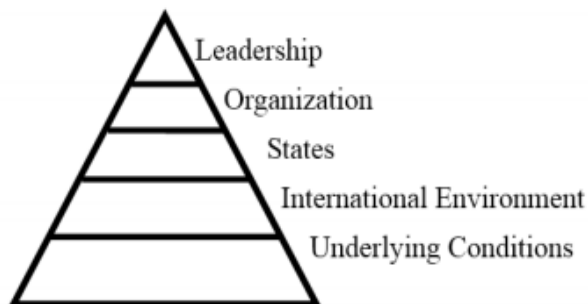
Figure 2: Structure of terror.

Despite their diversity in motive, sophistication, and strength, terrorist organizations share basic structure as depicted in figure 2. This is also referred to as the hierarchical structure of terrorist organization and the conditions for terrorists to take form which occurs sequentially.