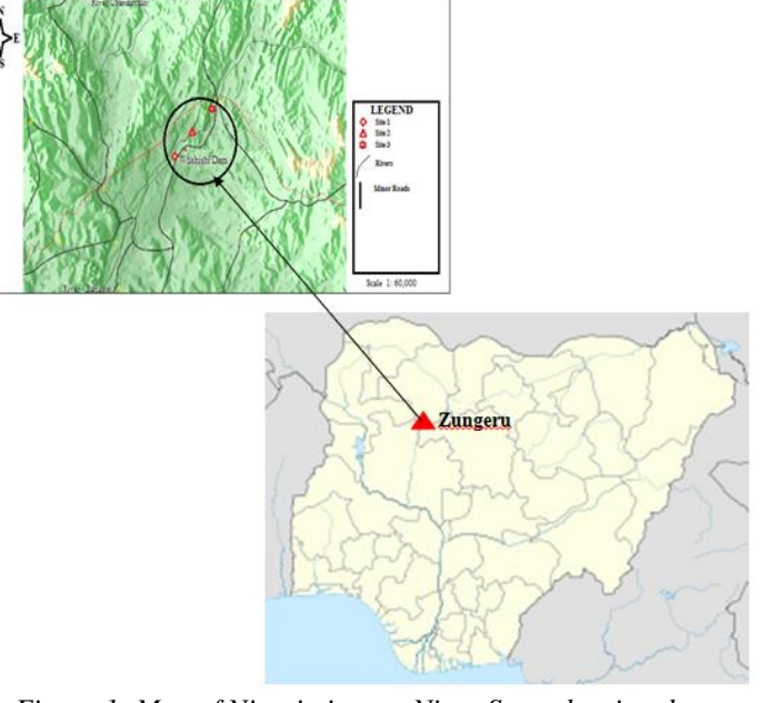
Figure 1: Map of Nigeria inserts Niger State showing the study area and sampling sites.

Water samples were collected monthly over a period of 5 months between February and June 2014 for laboratory analysis. Subsurface water temperatures, transparency, conductivity, turbidity, dissolved oxygen, biochemical oxygen demand, pH, water depth and flow velocity were measured. A mercury-in-glass thermometer was used for measuring temperature. A HANNA HI 9828 multi-probe metre manufactured by HANNA instruments was used for measuring values of DO, Conductivity and pH according to APHA (1998) methods. Transparency was measured using secchi disc. Water samples were collected in 1-l plastic acid washed bottles and transported to the laboratory in a cooler box containing ice. In the laboratory, water samples were analysed for BOD<sub>5</sub> (APHA (1998).