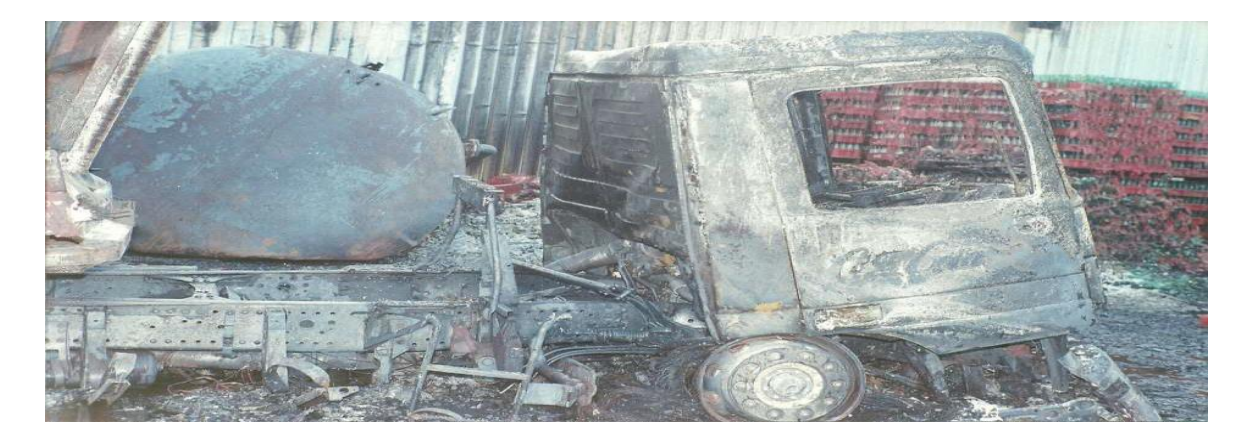
Plate 2.2: A typical Work Place Accident preventable through regular Factory and Labour Inspections