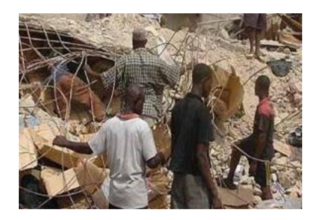
Plate 2.1: A collapsed building due to use of sub-standard material.

The sources of accidents on construction sites can be attributed to four (4) major factors. These are the design, construction, physical/environmental factors and mechanical factors (Ayininuola and Olalusi 2004). Ayininuola and Olalusi (2004) asserted that a large number of accidents have occurred in building sites due to failure of temporary or partially complete structures and poor specification. Ayininuola and Olalusi (2004) described failure as an unacceptable difference between expected and observed performance. A failure can be considered as occurring in a component when that component can no longer be relied upon to fulfill its principal function and therefore this can cause a health hazard. Ayininuola and Olalusi (2004) observed that many accidents in Nigeria have occurred in building sites due to lack of sufficient technical expertise by the builder. For instance, use of sub-standard material has led to building collapse as shown in Plate 2.1.