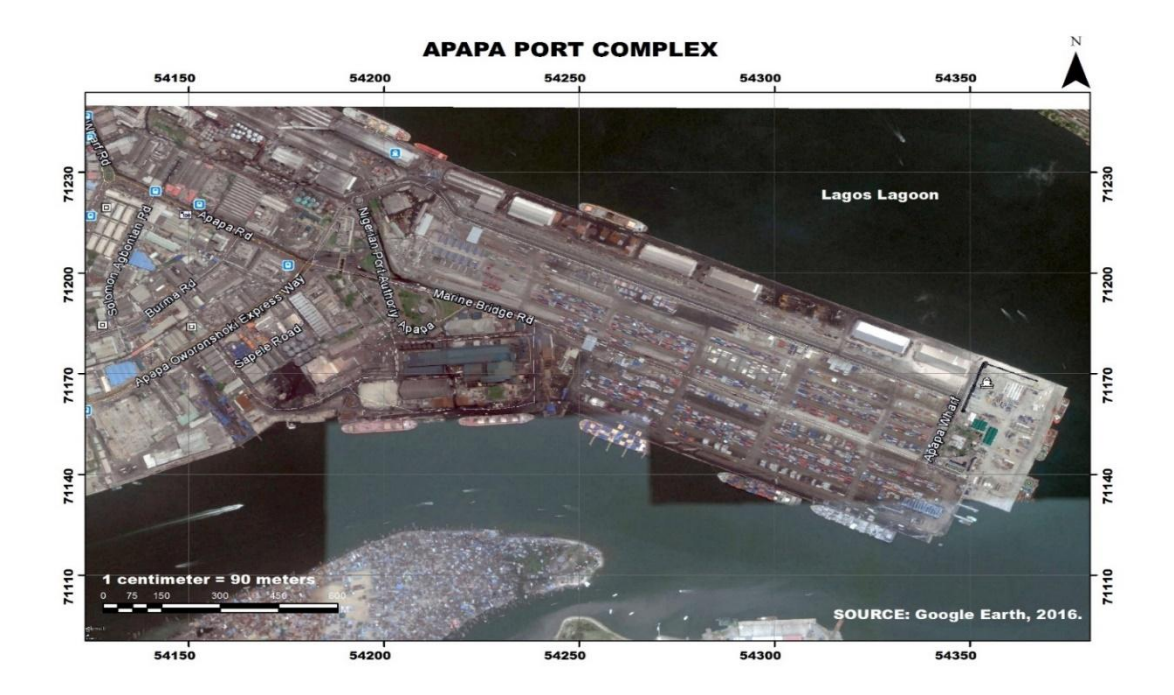
Figure 1. Apapa Port Complex

The study was carried out in the Lagos Port Complex which is located at the Apapa Area of Lagos and consisted of Apapa Port and a container terminal now called APM Terminal. It occupies a land area of about 120 hectares. Apapa port has conventional berths that service all cargo types. These include 24 berths for handling dry cargo and two berths for loading and discharging petroleum products. Six of the 24 berths are designated as container berths. The total quay length of the port is 1km and the average draught of the berths is 11.5m. It has 13 transit sheds with a total storage space of 78,869 square metres and 8 warehouses with a total space of 58,042 square metres. It also has support facilities for cargo on transit to ECOWAS countries. Apapa Port Complex was released on concession to four terminal operators namely, ABTL, ENL, GDNL and APMT. The Plate of Apapa Port Complex is presented in Figure 1.