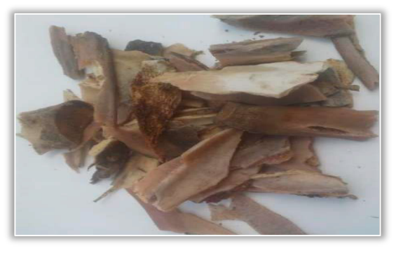
Figure 9: Cow Bones. Isiaka and Temitope (2013) investigated the influence of particle size distribution of cow bone powder on the mechanical properties of polyester matrix composites with the aim of considering how suitable it is to be applied as biomaterials. During the study, the cow bone used was thoroughly washed to get rid of unwanted materials and then crushed into smaller particles sizes using hammer. Sieve size analysis was conducted on the crushed bones and was sieved into three sieve sizes of 300, 106 and 75µm.

Due to large number of cows being slaughtered daily in the Nigeria, cow bones as shown in Figure 9 are abundantly available. These natural fibers are obtained from cow wastes which causes environmental pollution. Isiaka and Temitope (2013) reported that cow bone exhibit excellent structural compatibility in addition to the surface compatibility requirements as biomaterials. Mayowa et al. (2015) also reported that cow bone consists of living cells which are renewed constantly in the bone and widely scattered within a non-living material known as the matrix formed by osteoblasts cells. It was also reported that this osteoblasts in the bone secrete and makes protein collagen, which gives the bones elastic property which help it withstand stresses generated by lifting, walking, and other related activities.