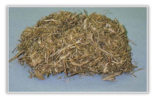
Figure 6: Bagasse.

little amounts of soluble solute. The percentage contribution Also, it was observed that with increase in temperature, the of each of these components in bagasse depends on the harvesting techniques. Bagasse contains about 30% hemicelluloses, 40% cellulose, and 15% lignin (Punyapriya, 2007).