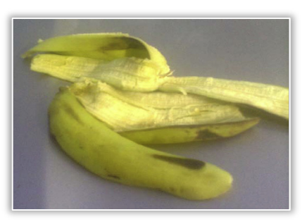
Figure 5: Banana peel (Source: Idris et al., 2013).

Banana peels shown in Figure 5 are also known as banana popular fruit consumed Worldwide with a yearly production of over 145 million tonnes. Once the peel is removed, the fruit can be eaten raw or cooked and the peel is generally discarded. Because of this removal of the banana peel, a significant amount of organic waste is generated (Babatunde,