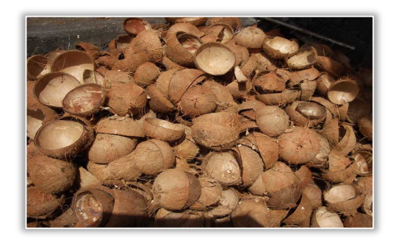
Figure 2: Coconut shells

renewability. Matthew (2012) reported that moisture the degradation of hemicellulose present in the shell and at The results obtained from the study indicated that the 240°C to 350°C, degradation of cellulose take place. The final stage of thermal degradation involves the breakdown of