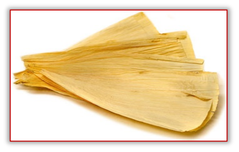
Figure 7: Maize husk

used to encase foods for baking or steaming thereby suitable eco-friendly replacement for asbestos and other imparting light maize flavour. agro-biomass friction materials in automobile brake pads