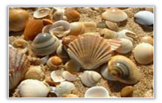
Figure 13: Seashells (Norazlina et al. , 2015) Seashells exhibit significant combinations of low weight, toughness, stiffness and strength which are in some cases

Natural materials such as seashell (exoskeletons of mollusks) is made up of three distinct layers which include the smooth inner layer composed mainly of calcium carbonate, intermediate layer (calcite) and the outer layer of horny substance known as conchiolin (Schaeffer, 2014). Norazlina et al. (2015) reported that seashell as shown in Figure 13 primarily consist of calcium carbonate (CaCO<sub>3</sub>), been naturally above 80% CaCO<sub>3</sub> by weight with only about 2 % protein content and no complex extraction process is needed to use it for composite production.