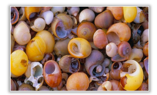
Figure 8: Periwinkle shells

Periwinkles shown in Figure 8 are small marine snails belonging to the family Littorinidae (class Gastropoda, phylum Mollusca). They are widely distributed shore snails which are usually found on stones, rocks or pilings. Some are found on mud flats while some tropical forms are found on the prop roots or mangrove trees. The shell of periwinkles is the outer casing of the animal which is usually discarded after the flesh inside is consumed. They are usually considered as agricultural waste products in riverine area of southern Nigeria (Yawas et al., 2013).