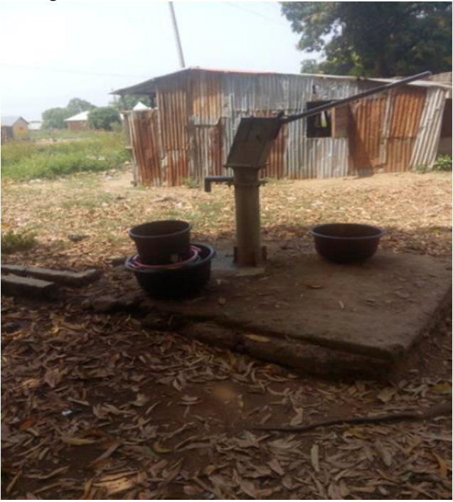
Plate 1: Typical rural borehole located at Birgi village

also shows little above the minimum limit in Jatai, Rafi Yashi, Korokpa, Birgi and Lapai Gwari, this may be due to run off during the raining season as shown in Table 3. The results are similar to that of Oyem et al (2014) and Edwin et al . (2015). The concentration is still within the safe limit of 6.5 to 8.5 standards set by WHO and NSDWQ. Therefore, it has no health implication with respect to pH.