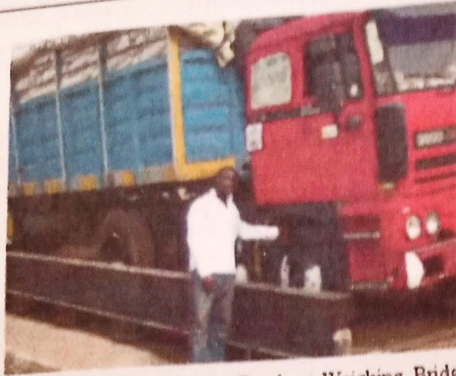
Plate 1: Typical Nigena Truck on Weighing Bridge