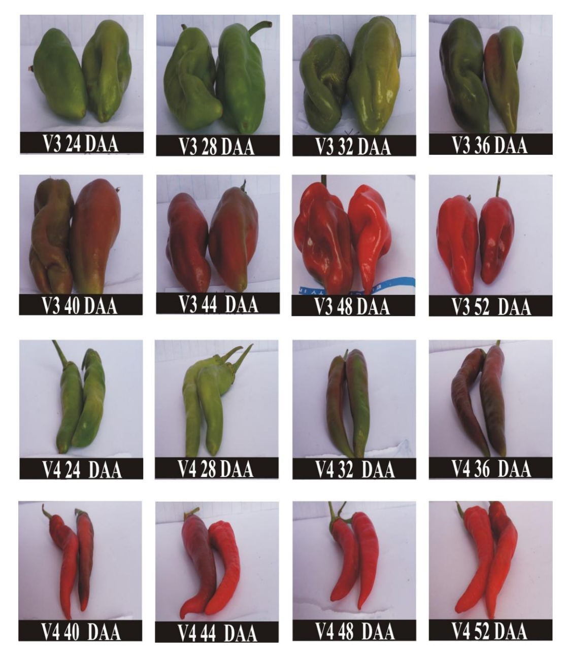
Plate 2: Changes in fruit colour with age in V3 and V4 accessions of pepper

Effect of fruit age on the seed quality of four pepper (Capsicum annuum L.) genotypes