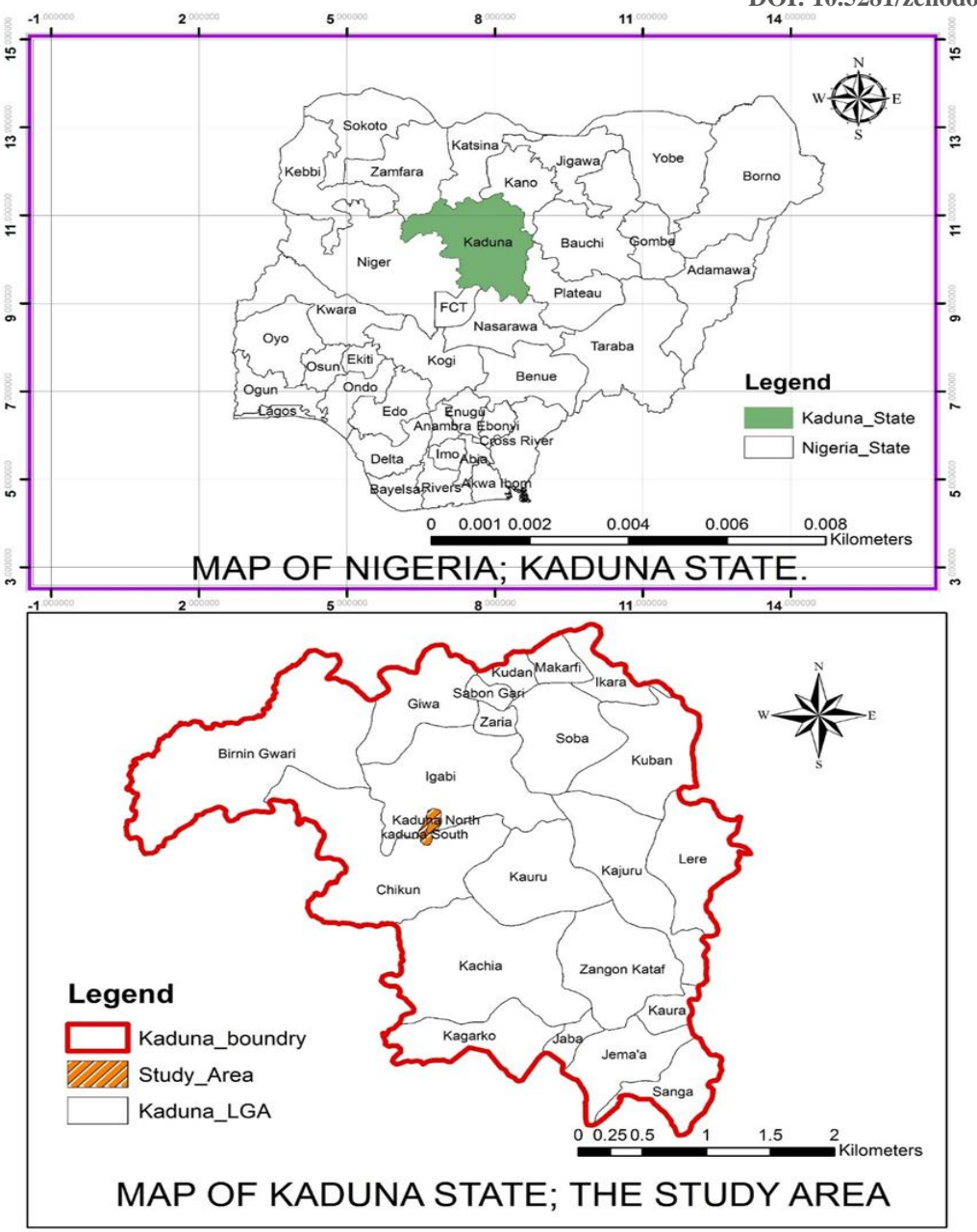
Figure 1: showing maps of Nigeria and the Study Area