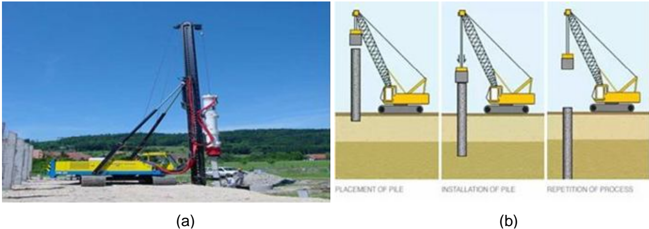
Figure 2. Pile driver: a) Drop weight hammer; b) Pile driving sequence.

moved radially as the pile shaft enters the ground. There may also be a component of movement of the soil in the vertical direction (Ascalew and Ian Smith, 2007). These piles are installed using modern, very high torque hydraulic drilling rigs which rotate a specialized displacement tool into the ground. The action of the specially designed tool causes the ground to be compacted, when the tool has reached the required depth it is withdrawn whilst concrete is pumped out through the hollow stem. Installation techniques used for driven i.e. displacement piles include: