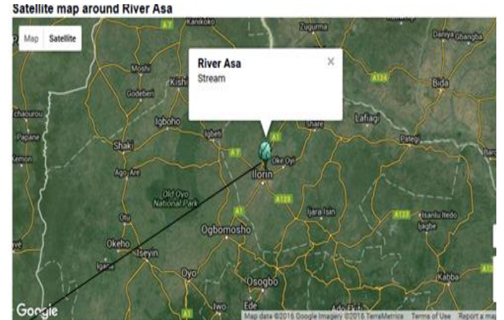
Seographic features & Photographs around River Asa, in Nigeria (general), Nigeria