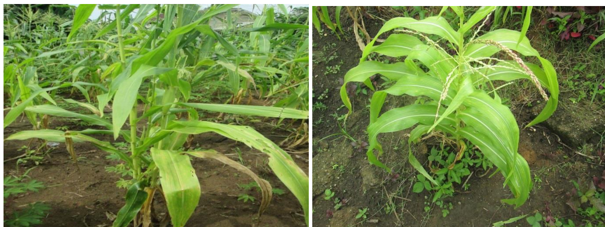
Plate I: Leaf mottling and streaking symptoms on infected maize plants

Symptoms observed on the maize fields were leaf mottling, yellowing, mosaic and streaks along the mid-rib of infected plants (Plate I). All the samples reacted negatively with MCMV and MDMV antibodies (data not shown). However, 38 % (41) of the samples exhibited strong positive reaction with MSV antibody (Table 1). Of the 41 samples that tested positive, the incidence of MSV disease was highest (51.2 %) in Kano, followed by Katsina (34.1 %). The lowest MSV disease incidence was found in Akwa Ibom and Cross River, with about 7.3 % each (Fig. 1). MSV incidence was observed at Bebeji, Garun Mallam, Kura, Dawakin Kudu, Kumbosto, Ungu and Tofa LGAs in Kano State. In Katsina, MSV was detected at Malumfashi, Musawa, Mutazu, Kankia, Charanchi, and Rimi. In Akwa Ibom State, the MSV positive samples were found at Uyo and Abak LGAs. In Cross River State, MSV was found specifically at Akai and Awi LGAs. Disease severity varied between 2 and 5 across the surveyed sites. Some of the susceptible plants were stunted and failed to produce cobs. In some others, small and deformed cobs were produced. In the late infected plants, disease severity did not affect cob formation.