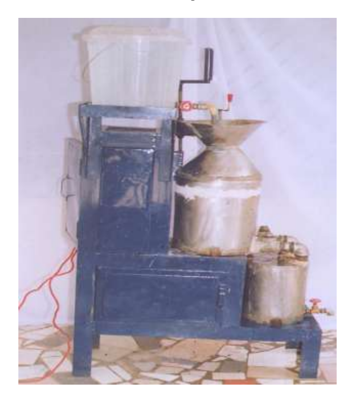
Plate I. Fabricated Grains drink processing machine

The major components of the machine include blending units, water holding tank, rotary perforated drum assembly and power unit. The blending operation is achieved by disengaging the perforated drum from rotation while the central shaft is in motion while the separation operation is achieved by allowing the perforated drum to rotate together with the central shaft as shown in plates I&II.