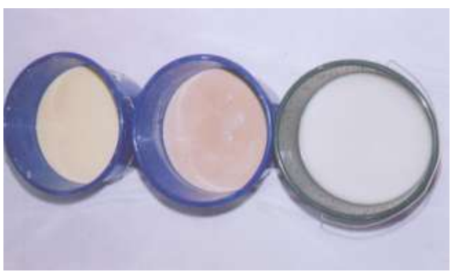
Plate III: Milled starch after processing In order to obtain dry quantities of starch and residue, the starch was allowed to settle down for 14hrs and the liquid

Three litres of water was added intermittently during the blending operation due to the high viscosity, flocculent protein content and stickiness characteristics of the grains. Each of the slurry was sieved with 1:7 liters of water in order to thoroughly wash the milled starch from the milk as shown in plate III. [1].