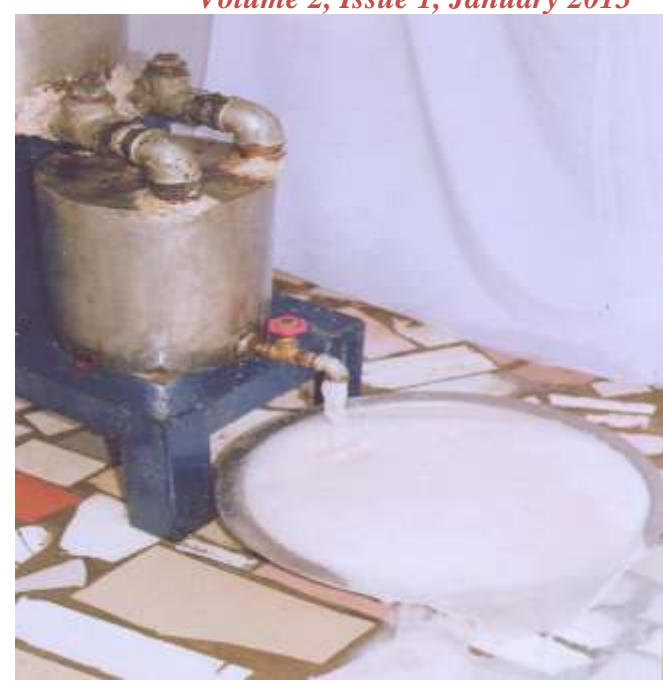
Plate II. Soybean milk during processing