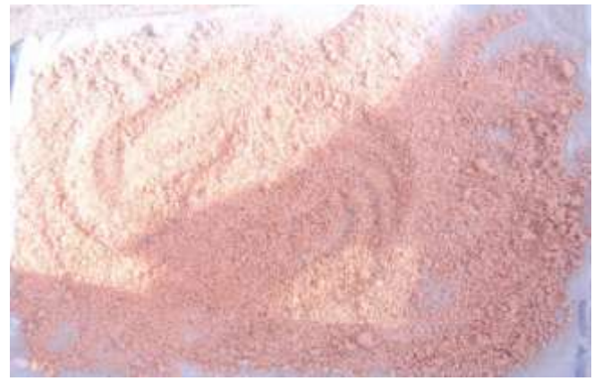
Plate IV: Residue from red guinea corn

fraction of the slurry was decanted and the starch and residue were sun dried to 10% moisture contents of as shown in plate IV.