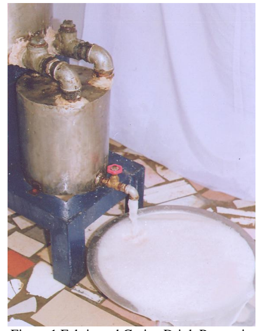
Figure 1.Fabricated Grains Drink Processing