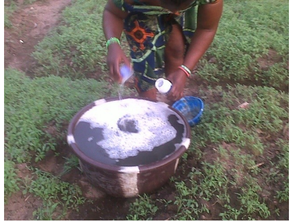
Plate 2: Woman trying to fetch water from Plate 3: Herbicide Application for legumes Dirty canal for irrigation Plate 3: Herbicide Application for legumes

Interview with the woman reveal that urban farmers have resulted into the use of such dirty, unhealthy water for irrigation of their farm crop as a result of short raining season and late rain. When interviewed as to why