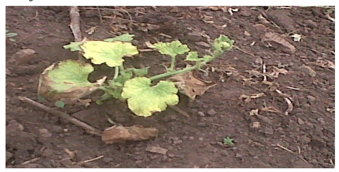
Plate 4: Drying up cucumber plant owing to high temperature

While the response of chemical fertilizer is undoubted, the effect on the soil and water body in adjoining area needs to be investigated. The study have identified that the extreme climatic condition will affects crop yield (see Plate 4), the human hazard exposures of this food produced are also needed to be further investigated as the effects of the herbicides on the quality of the farm produce and effects on human health investigated.