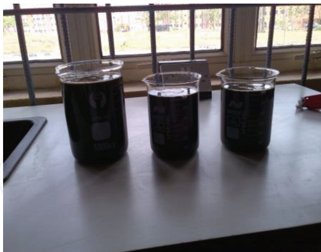
Figure 1. Samples of waste frying oil.