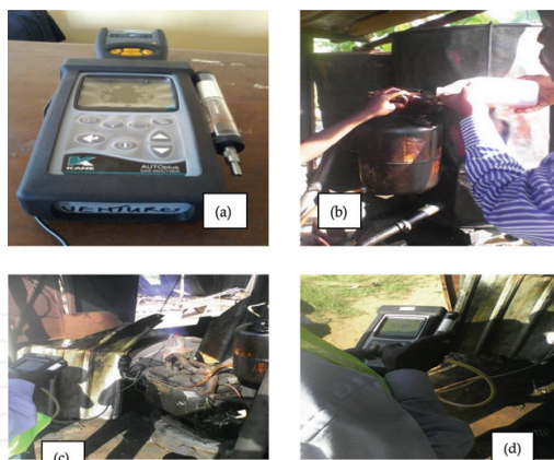
Figure 4. (a) KANE AUTOplus gas analyzer, (b) blended fuel being poured into the fuel tank of diesel engine, (c) gas emission analysis and (d) saving of analysis results on analyzer.