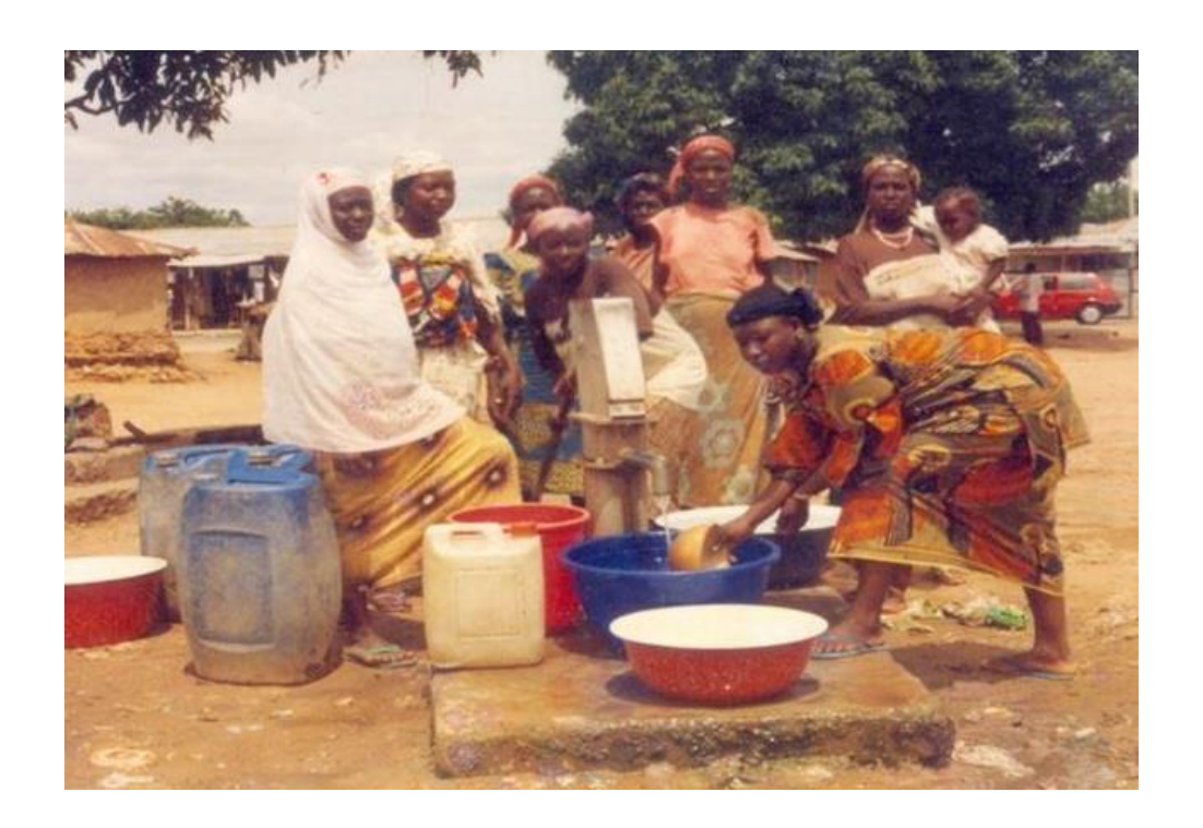
Plate 1. Women fetching water from a community hand pump borehole

• Government agencies, like WATSAN, should provide the platform through which donor agencies, NGOs and other philanthropists can give support to communities that have already been identified and scaled in order of priority.