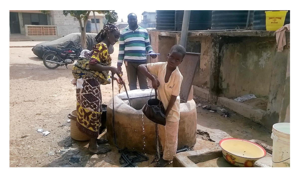
Plate 2. Fetching water from a community concrete lined well