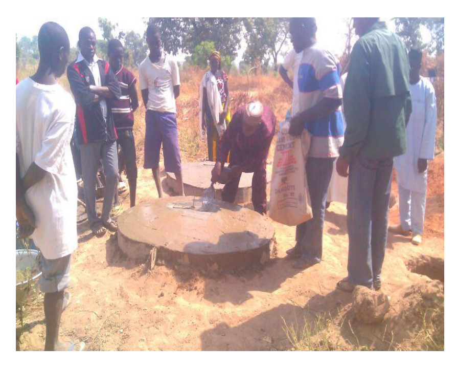
Plate 3. Preparing sanitary platforms for toilets