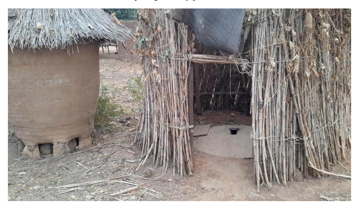
Plate 4. Basic latrine using simple materials at the community level