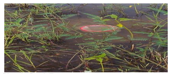
Plate 1a. Leech Trap

The Nigeria Leech Aliolimnatis michaelseni distribution was studied in Minna North Central Nigeria. Ten sites were selected from clusters of ponds such that it can be sampled in three days. Leeches were collected using two trapping devices (Pennuto and Butler, 1993) and by visually inspecting the undersides of rocks. The two trapping methods were a metal funnel trap and a burlap sack. Funnel traps were 17.5cm tall and 14.5cm in diameter. The funnel was made of 1mm mesh plastic window screen with an apex opening of 1cm. burlap sacks measured 90 x 30cm with a mesh of approximately 1mm. a funnel trap and a burlap sack constituted a trap pair (Plates 1a and b). 10 trap pairs were baited with frozen fish parts and placed at 50m intervals in litoral areas (S1 - S10) at a depth of less than or equal to 1m, traps were set at dusk and retrieved at dawn. Captured leeches were counted and preserved in 10% formalin solution. Presence of vegetation, surface area, temperature, pH and conductivity were recorded.