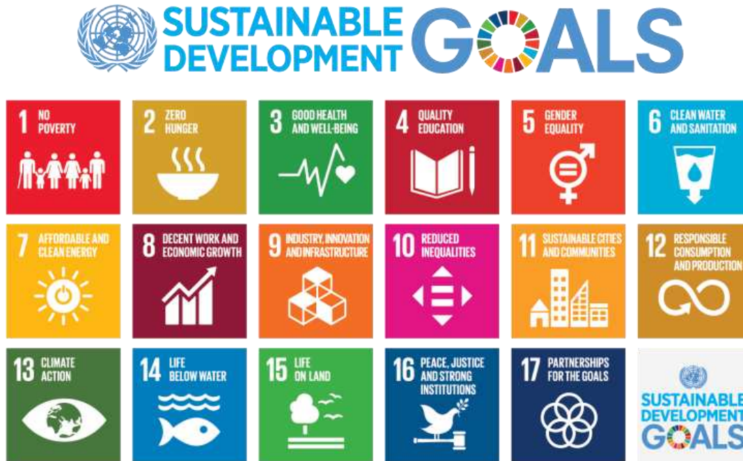
Fig. 5.1: The UN Sustainable Development Goals. ( www.news.un.org )