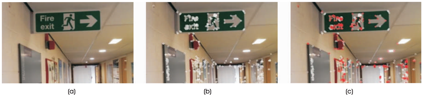
Figure 1. (a) Original Image showing an Exit Sign along a Corridor of the Kilburn Building of the University of Manchester (b) Keypoints Detected using FAST Detector. The White Circles indicate keypoints that also include other Interest Points such as Edges (c) In this Image, the Red Circles show the Strongest Corner returned after applying a Corner Response Function to the Detected feature from AST

The repeatability test obtained for all detectors (BRISK, ORB, SIFT, UFAH, and USURF) on a dataset of images