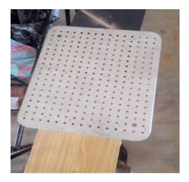
Plate III: Water Sprayer

are conducted to determine durability property of bricks such as degree of burning, quality and behaviour of bricks in weathering (https://theconstructor.org). To determine the water penetration rate a pipe is connected to a source of water and to an iron plate that has holes to enable the water to pass through and spray on the bricks. See plate III.