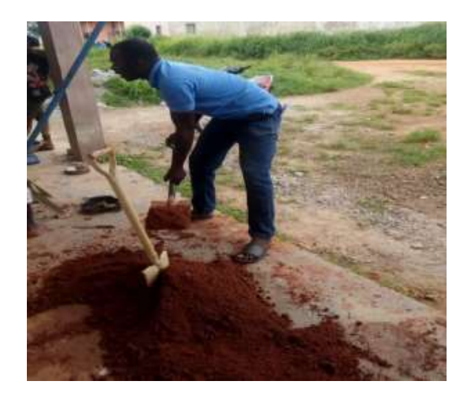
Plate VI Mixing of the laterite with the additive