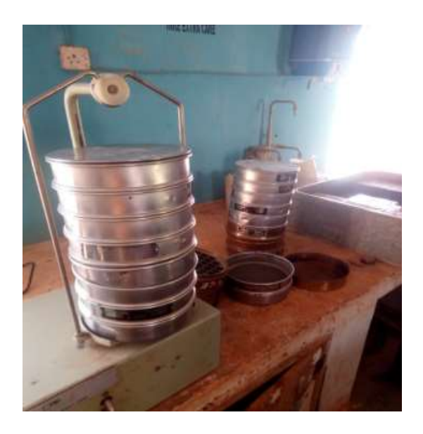
Plate I Sieves used for the experiment