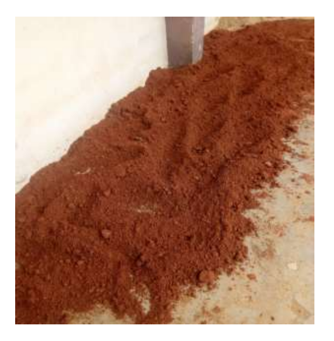
Plate IV: Laterite Open Air Dry