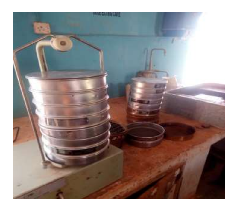
Plate I: Sieves

Sieve is an instrument used to carryout sieve analysis. Sieve analysis is a grading by size of particles of powdered or granulated material done with a sieve. Sieve analysis is a commonly used and most often the only practice to determine size distribution of grained materials. Standard sieve analysis is the fastest and most widely used quality control procedure in any powder process control industry (Advantech, 2001). The Plate I, shows the image of sieves of different sizes.