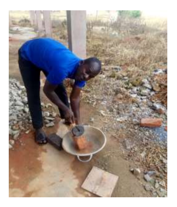
XI Abrasion test of the brick