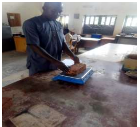
Plate X Weighing the brick