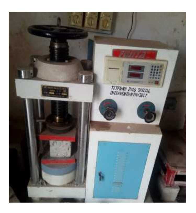
Plate II Compressive strength test machine.