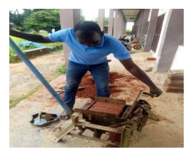
Plate VII Moulding of brick with compressed manual machine