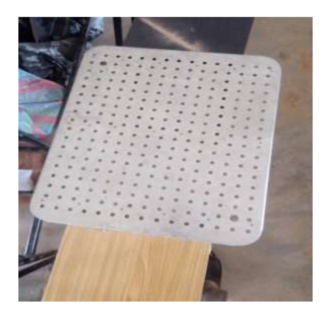
Plate III Water Sprayer