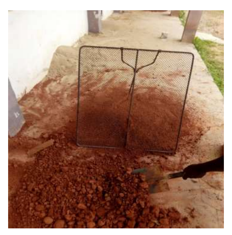
Plate V: Sieve lateterite using 5mm net