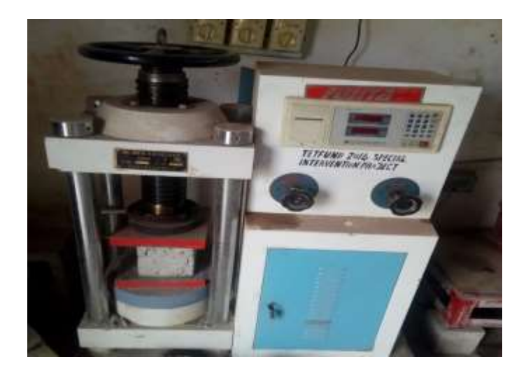
Plate II: Compressive Strength Test Machine

must meet the standard of NIS; this is because it helps in transmitting the load of overlaying structural element to the foundation. Thus Load bearing wall is a structural element. It carries the weight of a house from the roof and upper floors, all the way to the foundation. It supports structural members like beams (sturdy pieces of wood or metal), slab and walls on above floors above. A wall which doesn't help the structure to stand up and holds up only itself is known as a non-load bearing wall. It doesn't support floor roof loads above. It is a framed structure. Most of the time, they are interior walls whose purpose is to divide the structure into rooms.