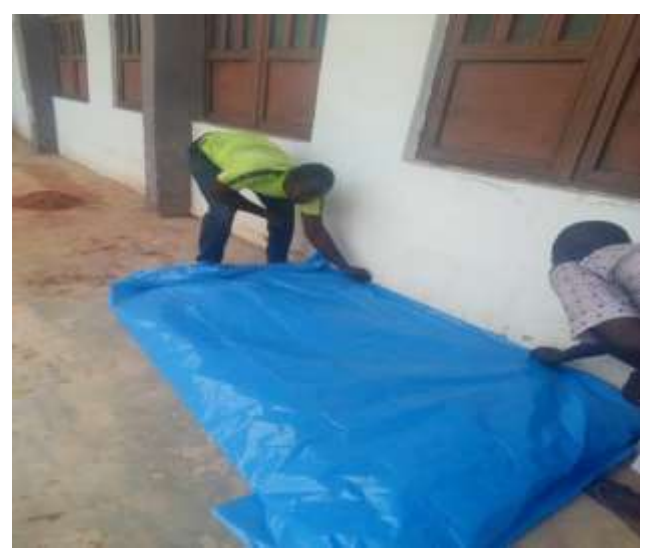
Plate IX Curing of the bricks.