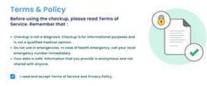
Figure 12 Disease Prediction Terms and Conditions

This is a requirement under the terms and conditions of using the checkup services. The illness prediction checkup, as depicted in figure 12, cannot be used unless the terms of service and privacy policy have been read and accepted (checked).