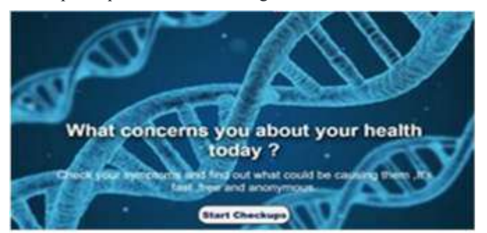
Figure 8 Disease Prediction Start up page

Figure 8 depicts the illness prediction start check up page. When you click start checkup, a quick, safe, and anonymous health checkup is requested as shown in figure 9