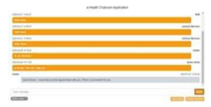
Figure 7 Live Chatwith Doctor WhatsApp Phone Number

Figure 8 depicts the illness prediction start check up page. When you click start checkup, a quick, safe, and anonymous health checkup is requested as shown in figure 9