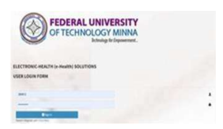
Figure 4 Two Factor Authentication Login Page

The user must login after successfully registering using the (2FA) code supplied to his email or mobile device and the password he set during sign up, as illustrated in figure 4. After providing both, the user is verified and given access to the medical server.