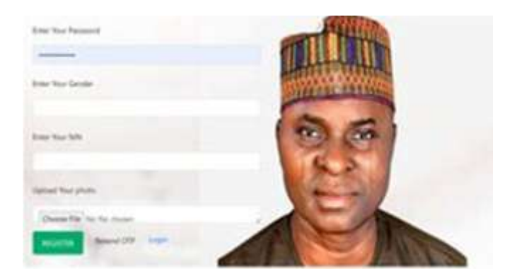
Figure 3b Sign up Page

The user must login after successfully registering using the (2FA) code supplied to his email or mobile device and the password he set during sign up, as illustrated in figure 4. After providing both, the user is verified and given access to the medical server.