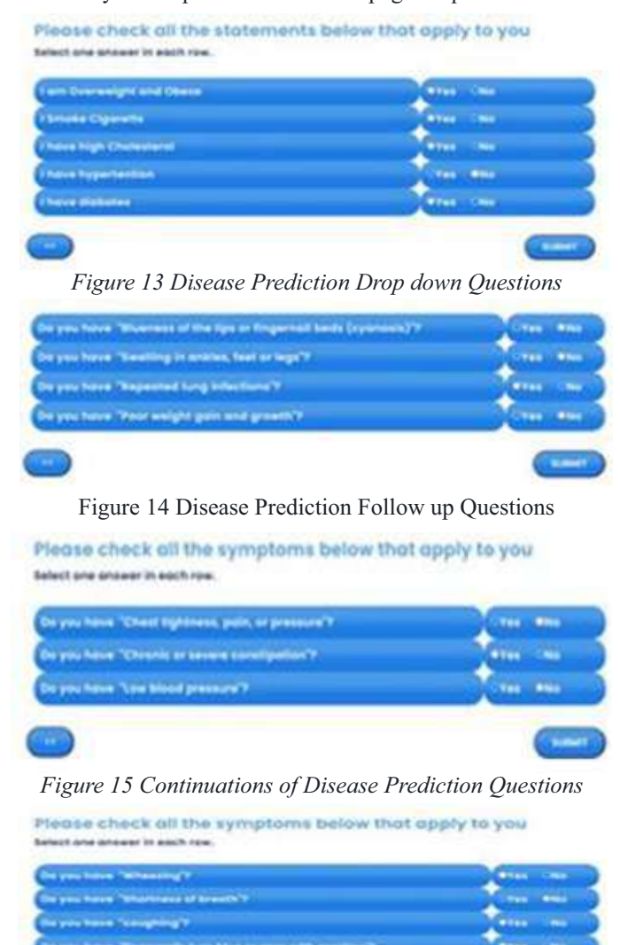
Figure 16 Last parts of Disease Prediction Drop down Questions

13 – 16, clicking the chest generates (Yes or No) fields of questions for the user to respond to. Any unanswered question at submission, you will be prompted to go back and respond to it before you can proceed to the next page of questions.