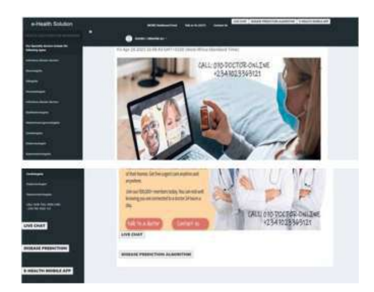
Figure 5 Portal Navigation Page

As seen in figure 5, the patient can now browse the platform's services that are offered. The navigation page lists every service provided by the eHealth site (Our specialist Doctors include Infectious Disease, Neuologist, Allegies, Dermatology, Opthalmology, Obstetrician/Gynecologist, Cardiologist, Gatroenterologist, Endocrinologist, and a toll-free Telephone number).