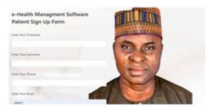
Figure 3a Sign up Page

This is the sign-up form for the eHealth Portal. The patient will be asked to register by providing information as indicated in Figure 3a and 3b, including his first and last names, telephone number, email address, password, gender, and national identity number (NIN).