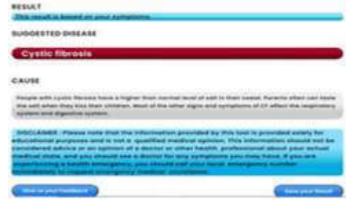
Figure 17 Disease Prediction Result

The outcome of the result will be shown, as in figure 17. The page will display the indicated ailment, the underlying cause, and a disclaimer stating that the material is offered primarily for educational reasons and is not a qualified medical opinion and should not be taken as medical advice or a doctor's opinion.