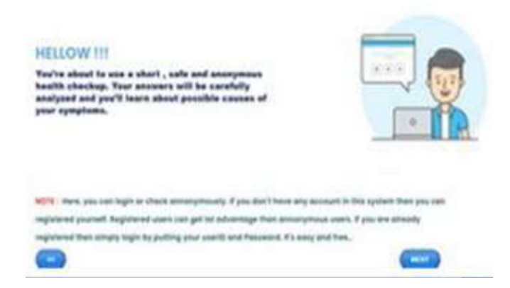
Figure 9 Disease Prediction Hallow

You must accurately enter your age on this page in order to receive the disease prediction result depicted in figure 10.