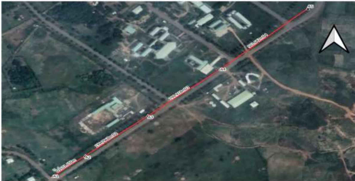
Figure 2: Established Calibration Baseline in FUTMINNA, Gidan-Kwano campus (2023)

between the school workshop and the staff quarters at the main campus of FUTMINNA.