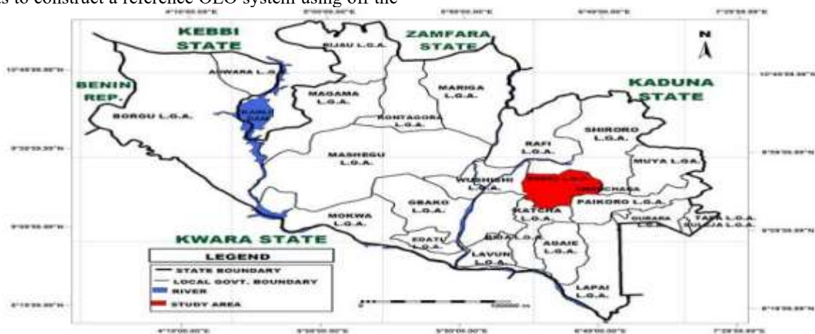
Figure 1: Map of Niger State showing Bosso LGA

Figure 1 depicts the FUTMinna Campus located at 09^{\circ} 32' 30.46''N , 06^{\circ} 26' 14.37''E at the top left, 09^{\circ} 31' 15.84''N , 06^{\circ} 27' 20.''67E at the bottom of the longitude and latitude respectively.