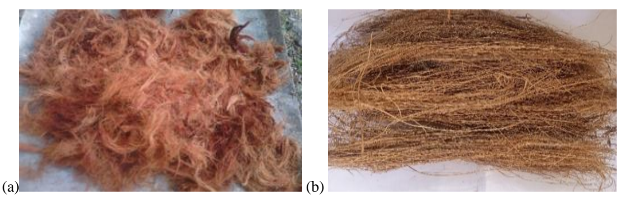
Figure 1: Coir fibre (a) un-treated, (b) treated

Portland cement type II (PC CEM II 42.5) in compliance with the standard of ASTM C 150-07 was used and the coir fibre used was collected from local sources in Minna and it environ. The fibre was treated with varied percentages of sodium hydroxide concentration and washed thoroughly in clean distilled water to remove all remnant of alkali on the fibre surface. The fibres were prepared for water absorption test by the alkali (NaOH) treatment process, which included scouring of the fibres, rinsing, neutralization and finally exposed to air for drying (Fig.1) before the sorption test was carried out.