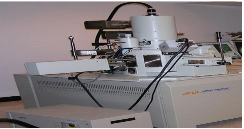
Figure 2: SEM Machine (JOEL-JSM 7600F)

the morphology and microstructure as effected by the treatment using the SEM machine (JOEL-JSM 7600F) as shown in Fig. 2.