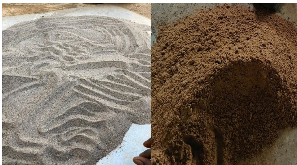
Figure 2. Photographic images of Itakpe Iron ore tailings and Natural Sand

The Itakpe iron ore tailings recorded specific gravity value of 3.12 while 2.65 was obtained for the Natural Sand as indicated in Table 4. The higher the specific gravity of any material the finer is the material, implying that the Itakpe Iron ore tailings has finer particles than Natural sand. The fineness modulus of IOTs is 2.43 while that of natural sand is 3.49. For fine aggregate materials, the lower the value of fineness modulus, the finer is the material. The results of specific gravity and the particle size distribution tallies and confirmed the availability of more fines particles in Itakpe Iron ore tailings compared with Natural Sand.