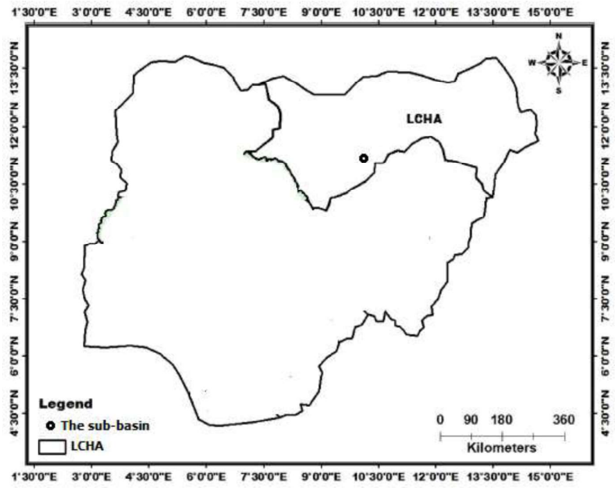
Fig. 1. Map of the study area

The Study area is located on latitude 11.8 N and longitude 9.8 E. It is situated within Lake Chad Hydrological Area, which is one of the eight hydrological area in Nigeria (Fig. 1). It falls within Sudano-Sahelian region and characterized with moderate rainfall and tropical climate. It experiences two seasons namely dry and wet season.