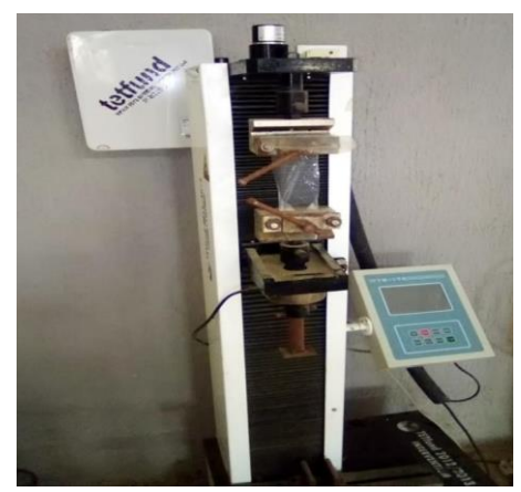
Figure 1: Tensile Strength Machine with Load indicator attached

NIS 835:2017 standards were adopted for the packaging films (ASTM, 2018). The thickness of all samples was measured using micrometre screw gauge, and the length and width were measured using a metre rule. To conduct the test, the samples were cut into dumb bell shapes of 85 mm length and 25 mm width, and loaded into the tensile grips (Figures I and 2). The grips were moved at a constant speed while the machine recorded the varying distance between them and the force applied. Once the specimen failed, the tensile strength and percentage elongation at break were noted from the indicator. This process was repeated for all three sets of samples and existing dried fish packaging films, and conducted in five replicates. Figure 3 shows dumb bell shaped specimens from a set of samples of the produced polypropylene packaging film.