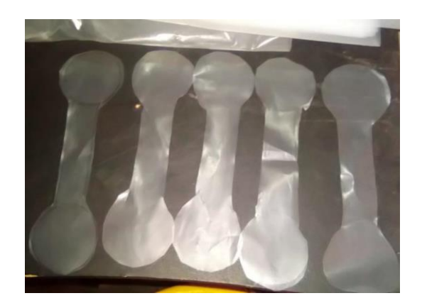
Figure 3: Dumb bell-shaped specimen from a set of samples of Produced polypropylene film ready for testing