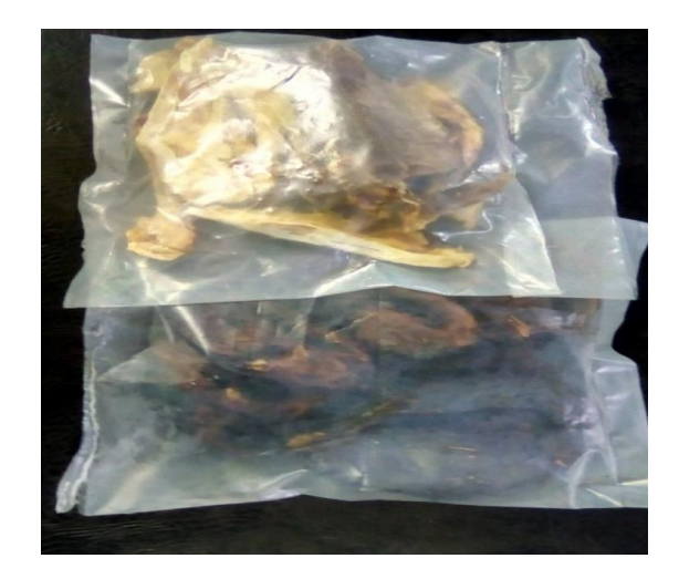
Figure 4: Vacuum Packaged Cat Fish and Cod Fish (Stock Fish) in Produced Polypropylene Packaging Films

The three set samples of the produced polypropylene packaging films were used to package dried fish using single chamber vacuum packaging machine. Six packages from each set of samples were selected. Figure 4 shows packaged dried cat fish and cod fish (stock fish) in produced polypropylene packaging films.