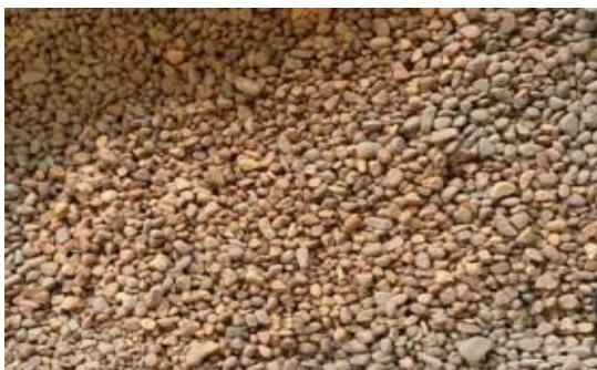
Figure II: Sample of Bida Natural Gravel (BNG)