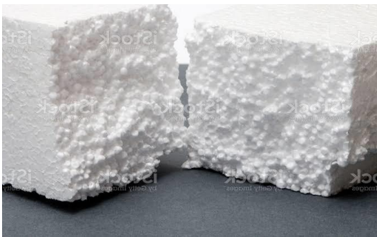
Figure I: Sample of Styrofoam

Materials used for this research work are; sand, cement, Bida gravel, water and styrofoam. Ordinary Portland Cement grade 42.5N (Normal hardening and 28-day compressive strength of 42.5 N/mm 2 ) was used for this research. The cement used conforms with BS EN 197-1 (2000). Fine aggregate was sourced from Minna area of Niger state. Bida gravel was gotten from Bida area in Niger state. The gravel was washed in 5 mm British Standard sieve to remove clay impurities which may affect concrete production and dried. Portable water was gotten from the civil engineering laboratory. The water used was colourless, odourless and free from visible impurities in accordance with BS EN 1008:2002. Styrofoam was sourced from an electronic shop in Kure market in Minna.