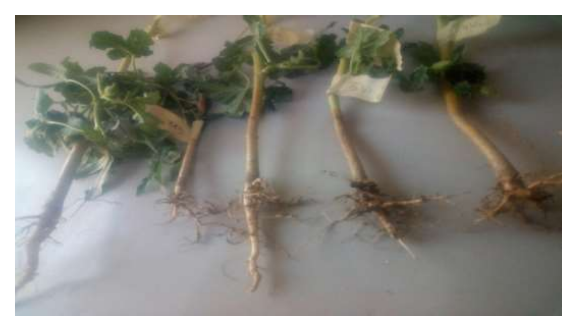
Plate I: Roots of okra plants with underground symptoms infected with Meloidogyne incognita showing galls on Okra plants root system

(fewer flowerproduction), an increase in production of empty pods which reduces number of seeds and deficiencies in assimilation process.