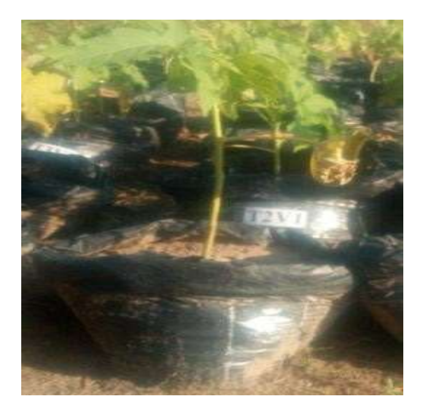
Plate. II: NHAe 47-4variety of okra plant