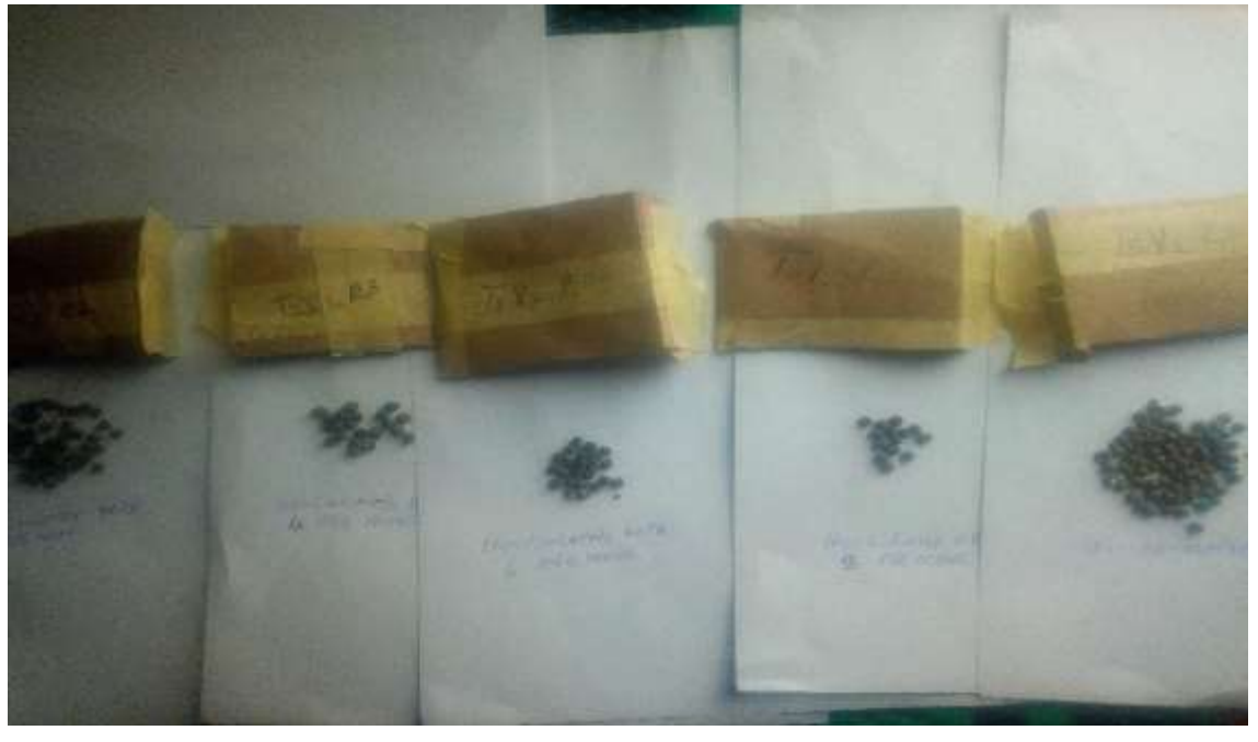
Plate VI: Number of seeds per fruit of (control and inoculated)NHAe47-4 okra plants at different inoculum levels.

Two eggmasses Four eggmasses Six eggmasses Eight eggmass Control.