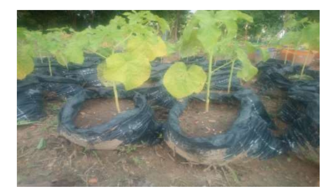
Plate III: LD88 Variety of okra plant.