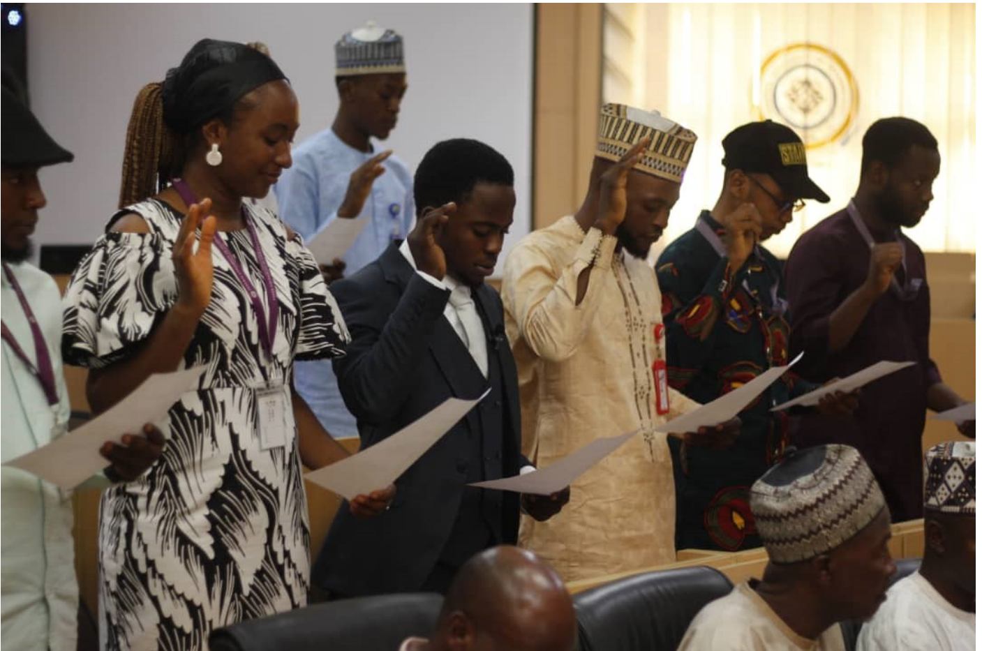
A cross session of the new officials taking their oath of office