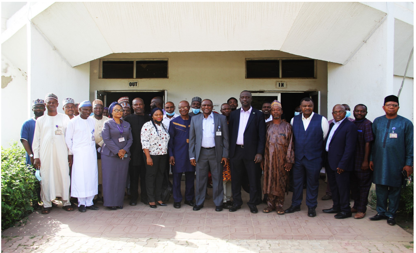
Principal Officers of the University in a group photograph with the accreditation team.