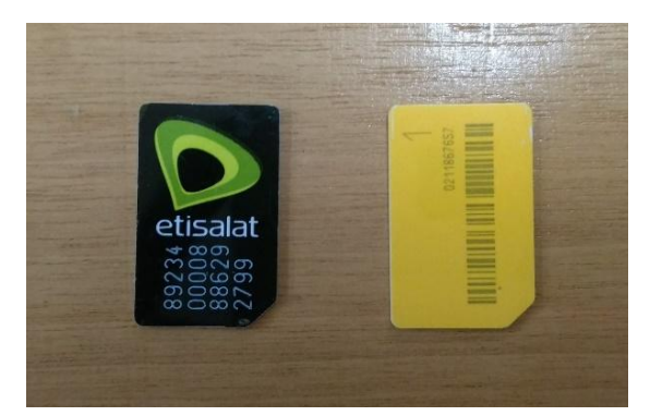
Figure 2. Picture of the two SIMs used for this research

1) Mobile 3G enabled SIM cards: The two SIM cards have 3G capability and only varying in their individual memory capacity SIM 1 of MTN network has 64kb of memory while SIM 2 of the Etisalat Network has 128kb of memory.