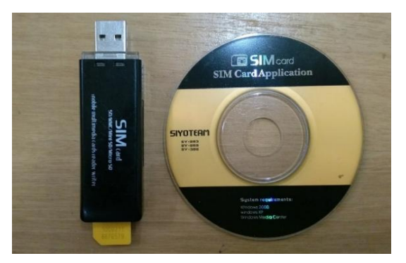
Figure 3. SIYOTEAM PC/SC Smart SIM card reader and driver disk

• The software were all installed on an Hp system running Microsoft windows 7 64 bit. Also .NET frameworks was installed to support operations of some of the tools.