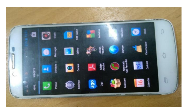
Figure 4. TECNO Andriod phone (Phantom A+)