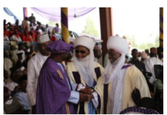
The Executive Governor of Niger State, Alh. Abubakar Sani Bello congratulating the Royal Fathers