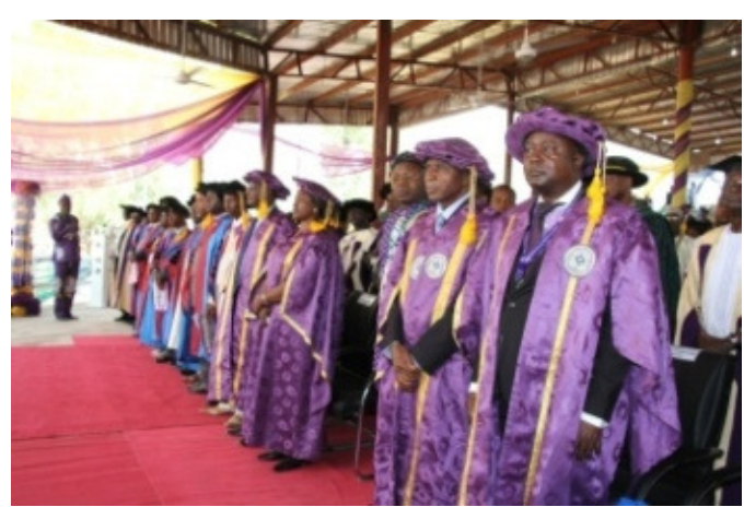
Cross section of POs and other Deans at the Convocation Square