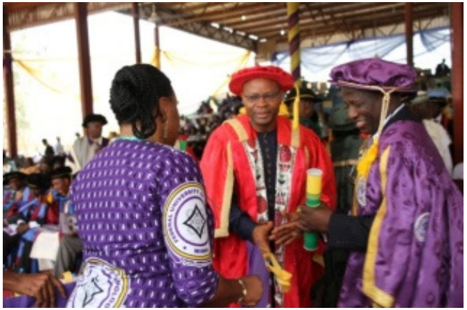
receiving goodwill message from one of the visiting Vice-Chancellor