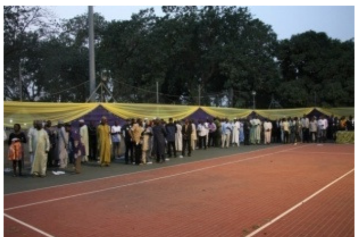
Cross section of guests at the event