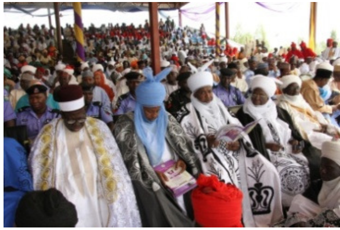
Cross section of some Royal Fathers at the event