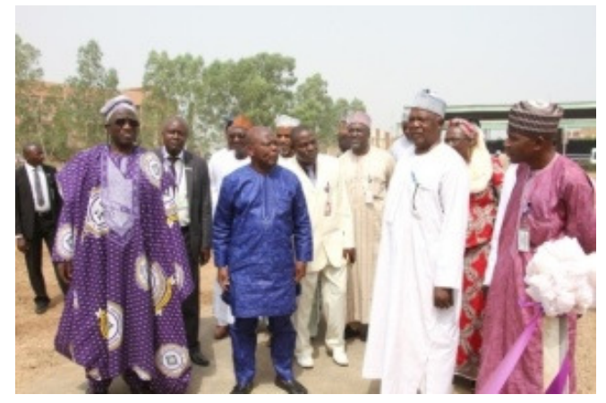
The VC, Prof. Akanji leading Council members and others to the Convocation Exhibition stands at the Main Campus