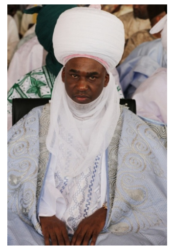
The Emir of Gombe, Alh. Abubakar Shehu-Abubakar III