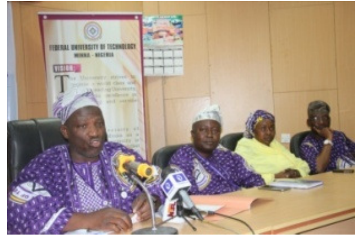
The VC, Prof. Musbau Adewumi Akanji addressing journalists during the press briefing for the 34^{\rm th} Founder's Day and 26^{\rm th} Convocation ceremony.