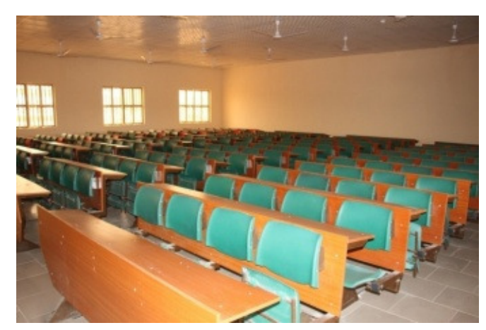
One of the newly commissioned classrooms