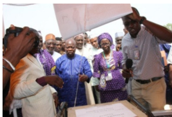
Dignitaries inspecting some prototypes displayed at the Convocation Exhibition stands