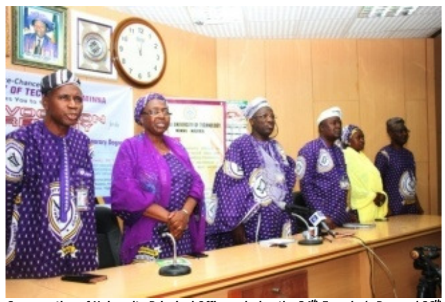
Cross section of University Principal Officers during the 34<sup>th</sup> Founder's Day and 26 Convocation ceremony press briefing at the Senate Chamber.