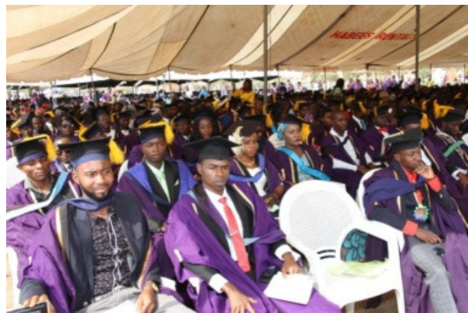
Cross section of graduating students