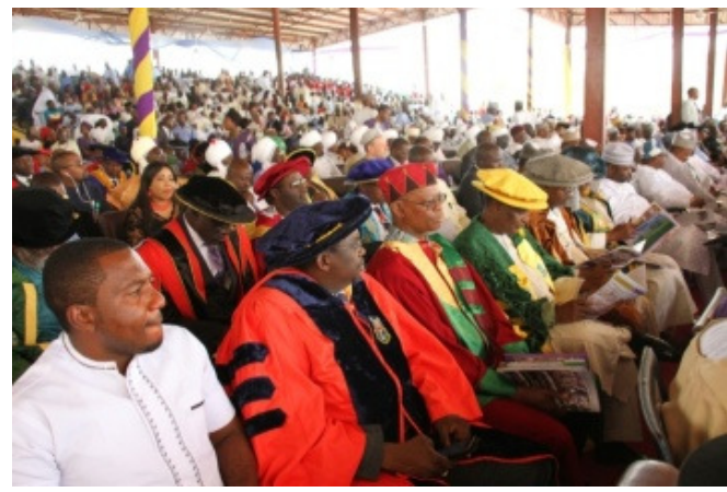
Cross section of some visiting Vice-Chancellors at the event