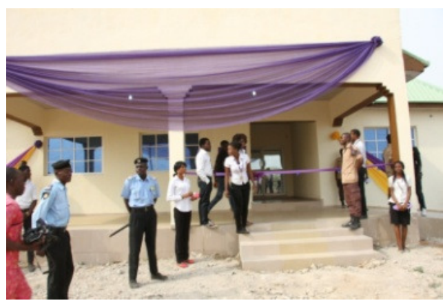
Front view of the newly constructed Search Fm Building