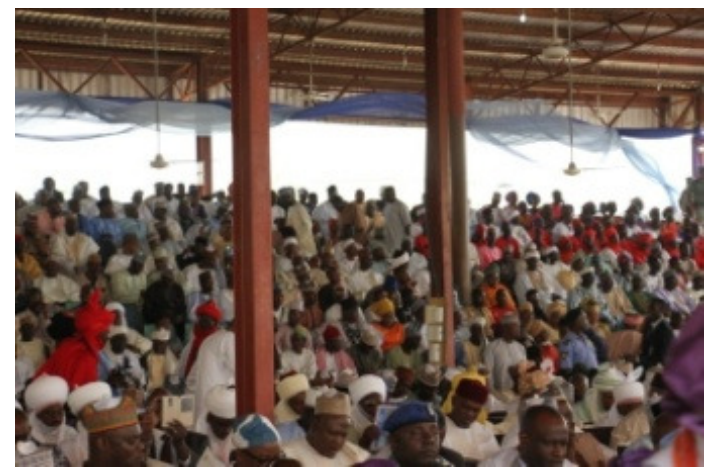
Cross section of guests at the Convocation ceremony