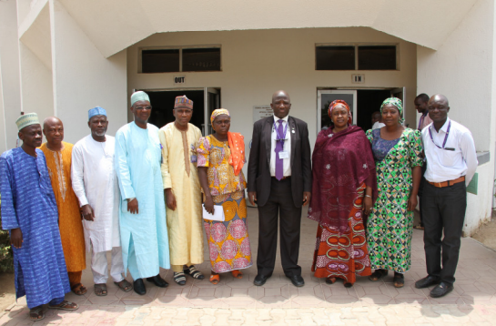
team were received at the Vice- staff School Management and POs after the courtesy visit

The University Staff School, FUT, Minna was established on January 28, 1987 with the motto "Excellence is our goal."