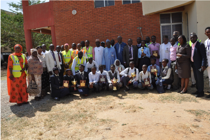
POs, University's staff, Representative of NEMA, NSEMA and participating schools in a group photograph after the programme

The Centre for Disaster and Risk Management and Development Studies (CDRM&DS), Federal University of Technology, Minna, in conjunction with National Emergency Management Agency (NEMA), Niger State National Emergency Management Agency (NSEMA), and Niger State Ministry of Education has organised the 4th Edition of the disaster risk reduction quiz and debate competition and award ceremony for secondary schools in Minna, Niger State.