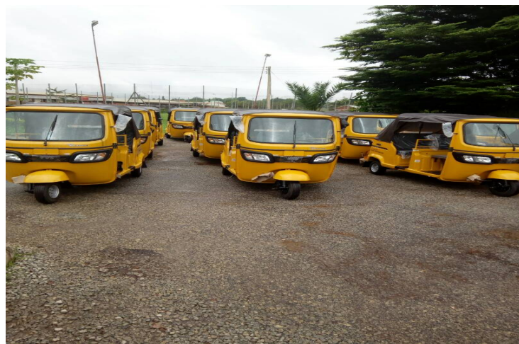
Some of the tricycles on display at the event.

The Acting MD disclosed that over 100 applications were received from customers of the bank out of which 27 customers were selected as beneficiaries of the pilot phase of the scheme, adding that the scheme would complement the State government's effort aimed at providing employment for its teeming youths.