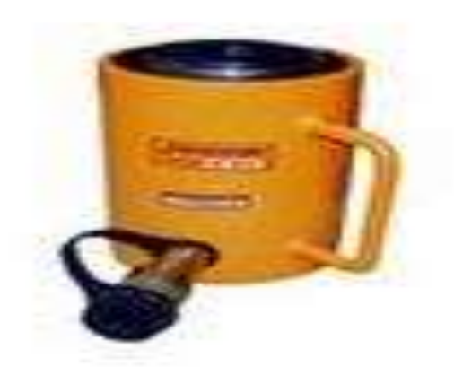
Figure 2.6: Centre Hole Single Acting Jack