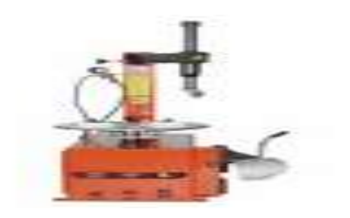
Figure 2.7: Tyre Changers

The provision of tyre changers that are equipped with bead breaker handles rims extremely gently and safely (Figure 2.7) is also required in an automobile industry for easy operation by physically challenged persons. These tyre changers occupy less space as the side swinging mounting arm enables the user to install it near the wall. When manufactured using A-grade raw material, these tyre changers are acclaimed for their corrosion resistance and long service life.