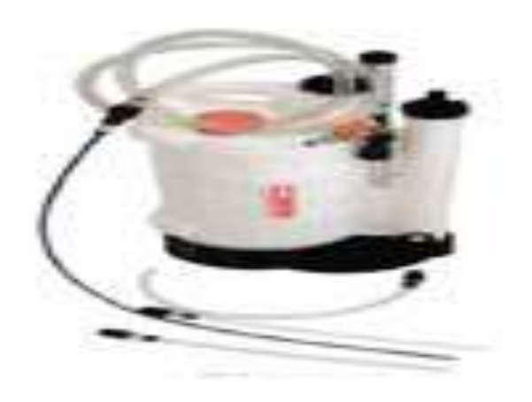
Figure 2.2: Pneumatic fluid Extractor