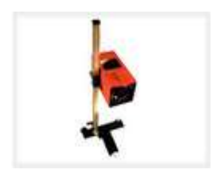
Figure 2.5: Head Bean Aligner

with Lux Metre and without Lux Metre. Depending on the needs of the clients, they can be supplied with extra long rails allowing unit to be wheeled away in drive-through application (Figure 2.5). Also, headlight beam aligner takes little space and requires space of only 500 mm between vehicle Head Lamp and Lens.