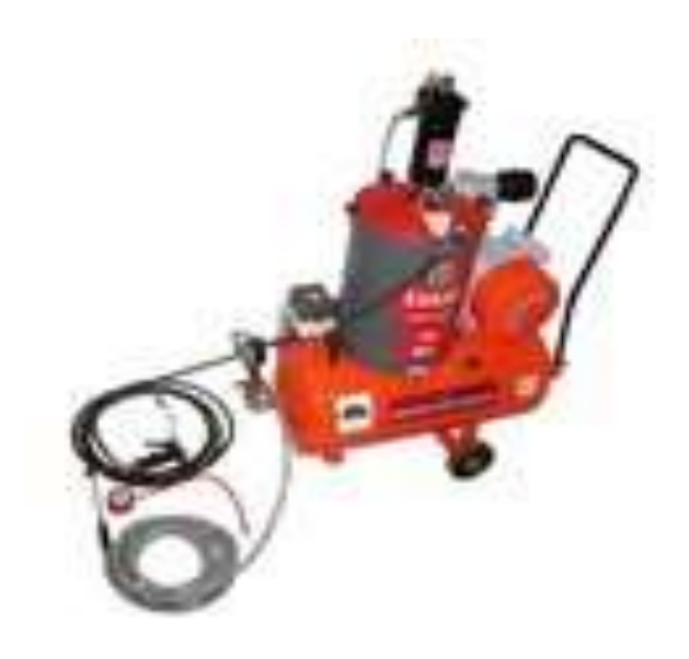
Figure 2.4: Auto Service Unit (Automatic Operation)

This equipment (Figure 2.4) enable smooth transport of the unit even on rough and uneven surfaces, these units are equipped with two nylon wheels which are used to spray painting. Following are the various parts of the unit: Reciprocating Air Compressor - SKM15, 1.5 HP rating direct coupled, with an FAD of 2cfm, at a maximum working pressureof10kgf/cm², The compressor unit is highly balanced, fitted with roller bearings for the connecting rod and crank, automotive type piston, and deep finned cylinder and cylinder head, The valves are finger type and the compressor is mounted on 45 liters horizontal air receiver grease Pump m- SKGP 20