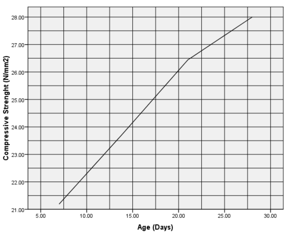
APPENDIX VI Compressive strength for granite