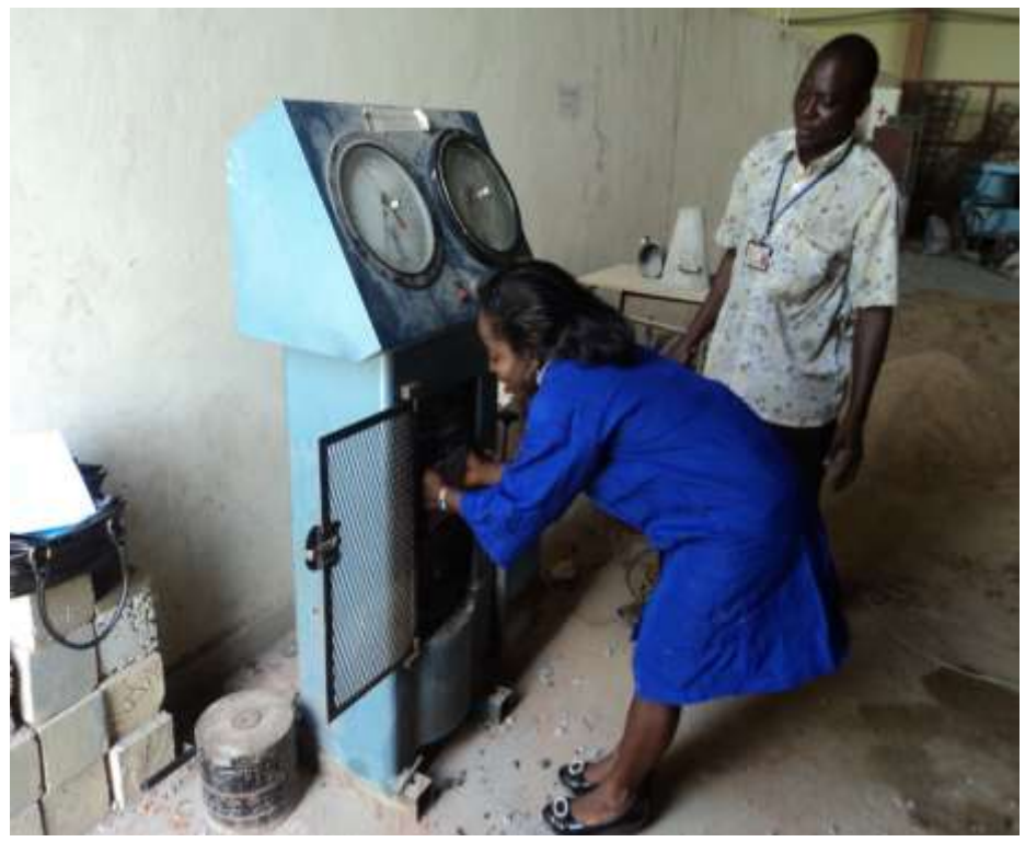
Taking reading of the crushing load

Putting the casted cube inside the machine for crushing