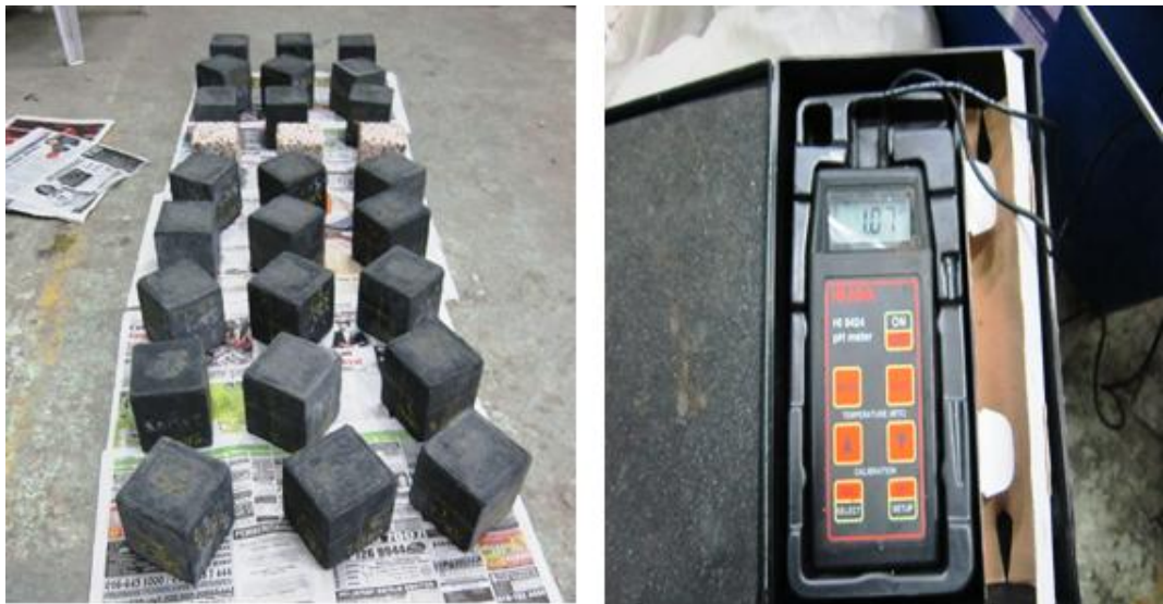
Figure 1: A pictorial view of acid sulphuric attack and pH test in progress

The performance evaluation of aerated concrete with pozzolanic materials in acid environment was tested. Cubes of the dimensions (100 x 100 x 100 mm) comprising of two sets of mixed namely aerated concrete with pozzolanic materials and OPC concrete as a control are casted and subjected to water curing in the laboratory over 28 days. The experimental work begins when specimens are immersed in sulphuric acid solution with pH value of; 1. In order to determine the extent of the material durability towards sulphuric acid attack, the weight loss of the samples involved in the testing was examined. The tests are taken every two weeks beginning from the time that was immersed in sulphuric acid solution, prepared using 0.5% sulphuric acid of 98% concentration. The pH of the solution is controlled at every 2 week after remove the specimen. Figure 1 shows a pictorial view of acid sulphuric attack and pH test in progress. The quantity of water, aggregates and superplasticizer and the mix proportion are shown in Table 3.