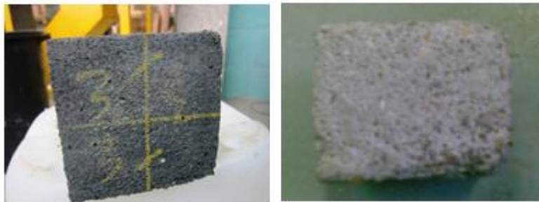
Figure 2: Appearance of specimens after immersed in 5% sulphuric acid solution

The visual appearance of aerated concrete and OPC concrete specimens are shown in Figure 2. The surface conditions of these specimens were observed.