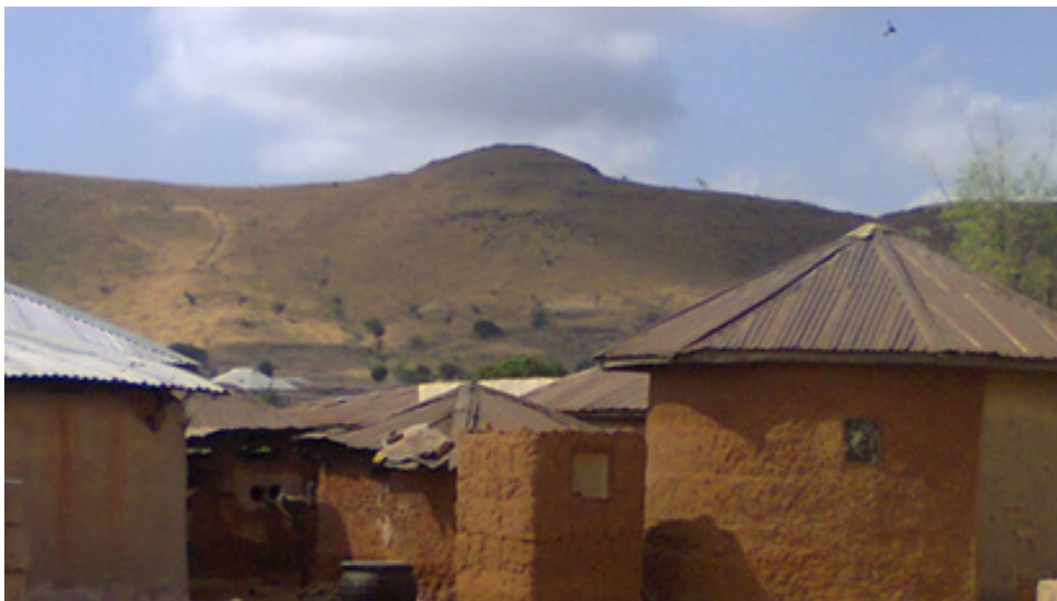
Figure 2. The community and its surrounding hill landscape