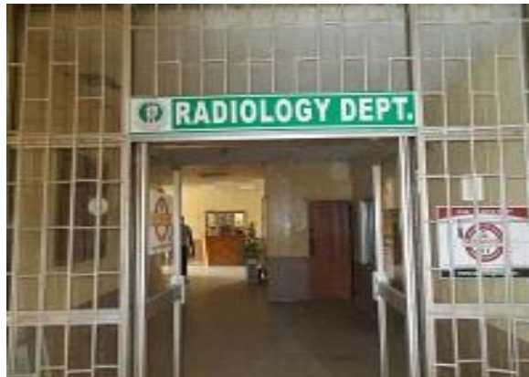
Signage of Radiology Department (participants' consent obtained in the field)

Similarly, landscape elements such as trees were used as landmarks by the participants to identify their desired destination (See Figure 3). The following excerpt from the respondents clarifies further: “I used the tree to locate my destination” (R22). This implies that trees and signs in the hospital constitute the main landmarks during wayfinding.