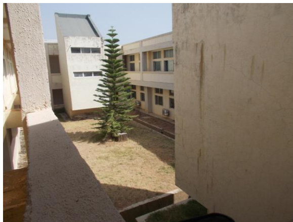
Landscape Tree at the Laboratory (participants' consent obtained in the field)