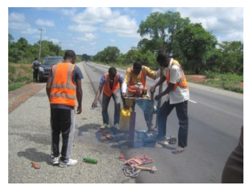
Fig. 2. Coring through the pavement structure..

In conducting the DCP test, a light weight 8kg rammer, 60-degree cone head Dynamic Penetrometer was used. The number of blows for each 10cm penetration was recorded, and averages of number of the blows were used to calculate the CBR of the pavement structures. In estimating CBR of the pavement structures, the correlation (equation 1) advanced by TRL [36] was used.