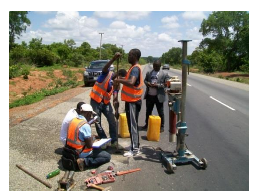
Fig. 4. Dynamic Cone Penetration test.

Laboratory tests, carried out on the cored asphaltic samples included Marshall Stability test, bulk density test, bitumen content test, flow test, void ratio test, determination of percentage voids filled with bitumen and aggregate grading test. Marshall Stability and flow of asphalt mixtures tests were conducted according to ASTM D6927-15 [37], while bitumen content extraction test was carried out using Centrifuge Extraction Procedure, as highlighted by ASTM D2172/D2172M-11 [37].